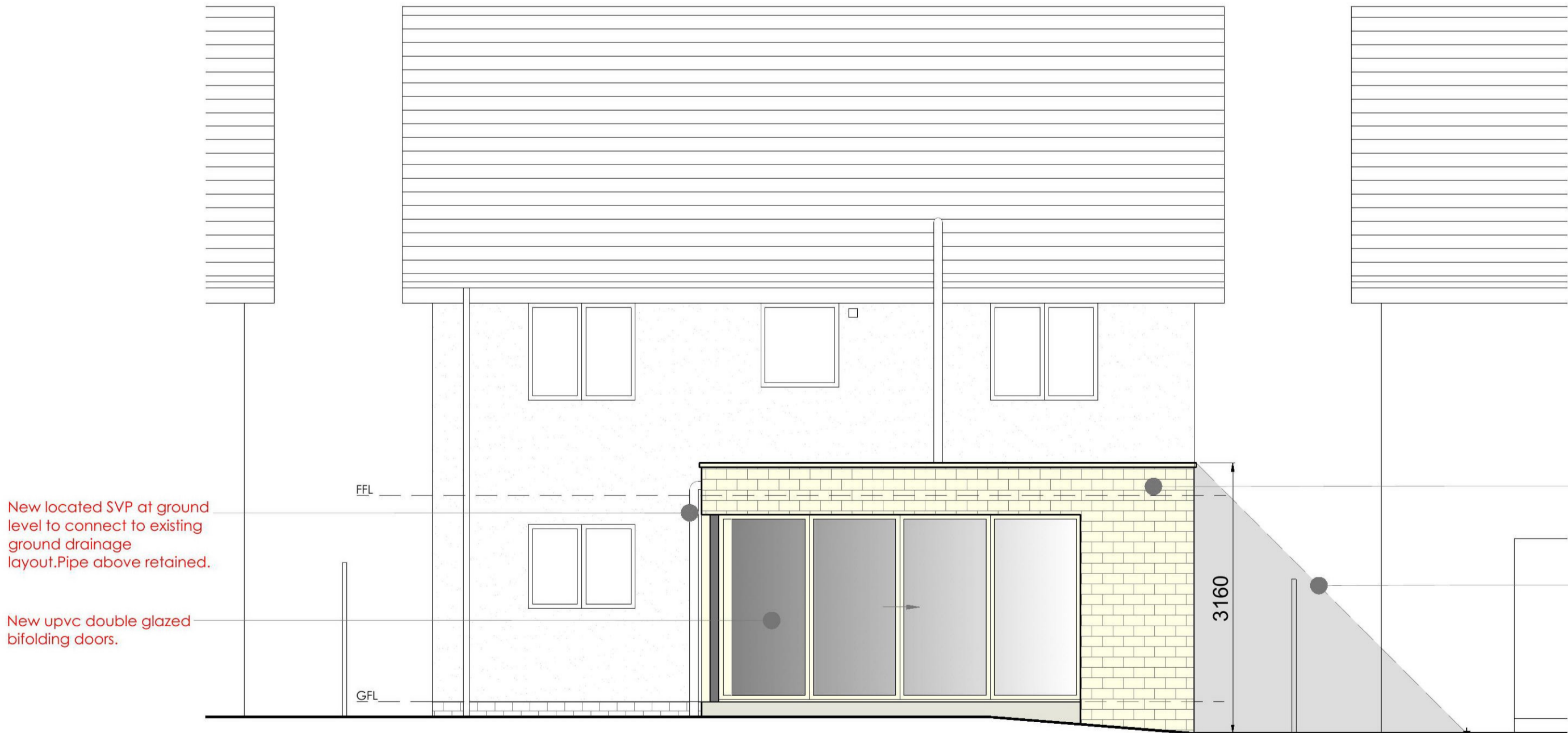
2 PROPOSED NORTH EAST ELEVATION SCALE: 1:50

Proposed Rear extension (22.5sqm) finished in Stone to match existing property. 45 Degree angle as per the Householder Guidance document.