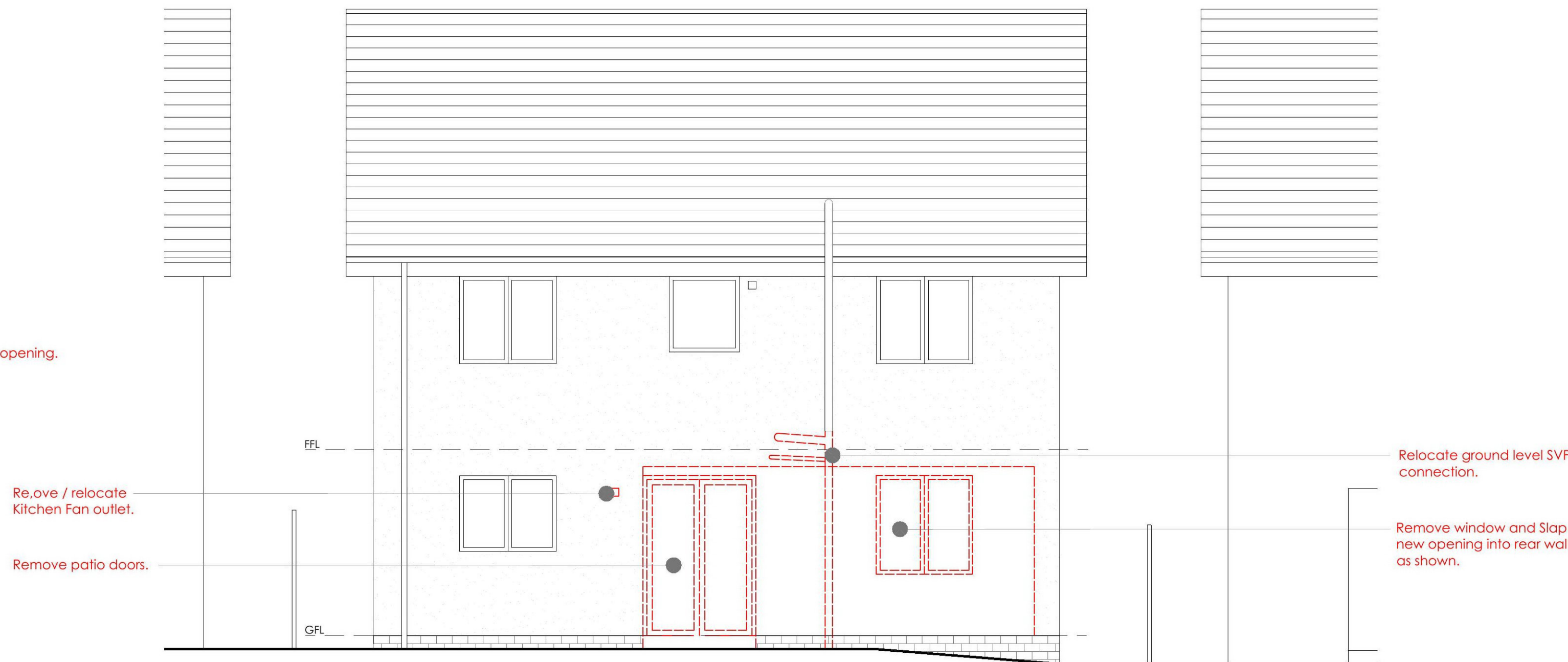
2 EXISTING NORTH WEST ELEVATION SCALE: 1:50