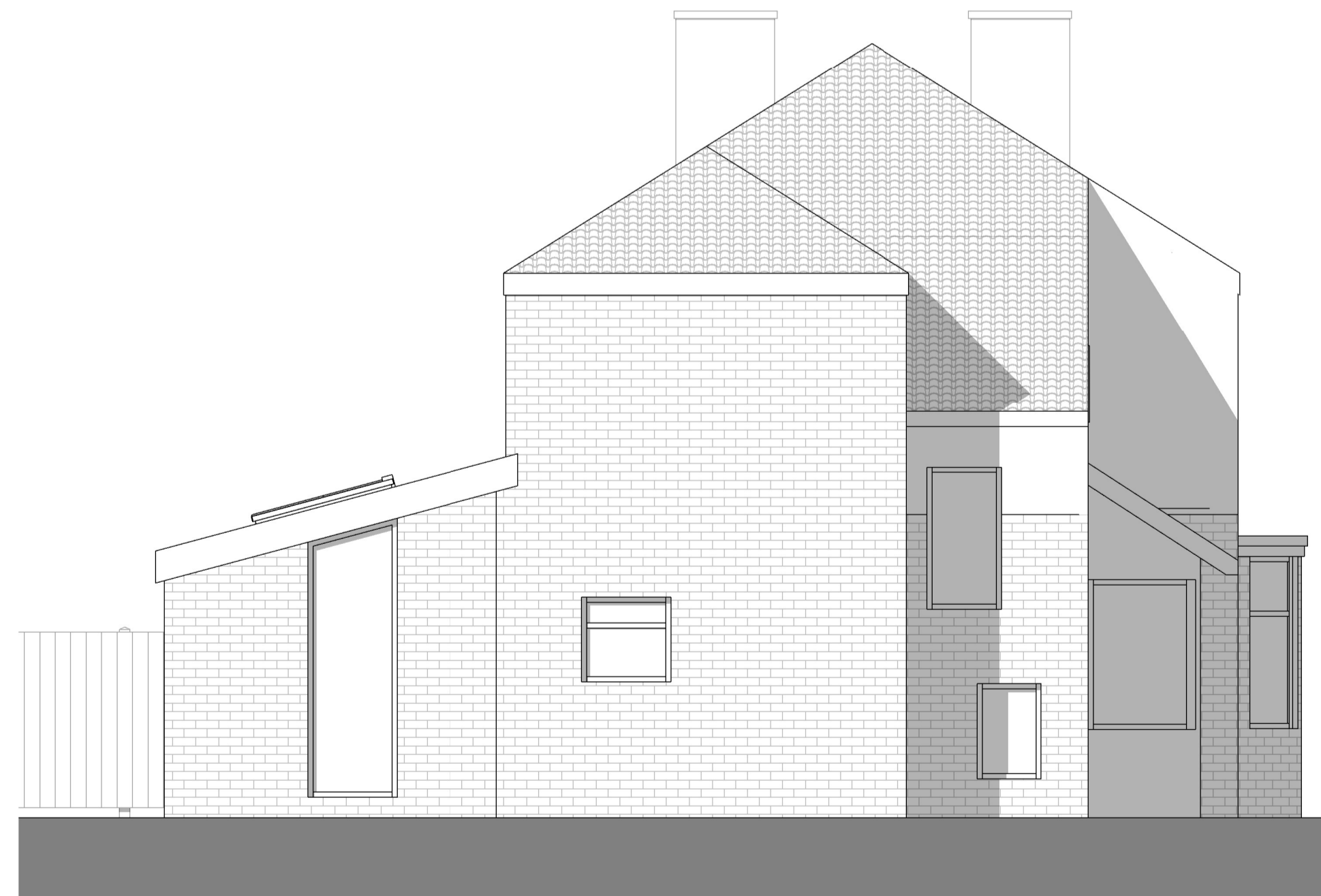
Existing Elevations - South-West