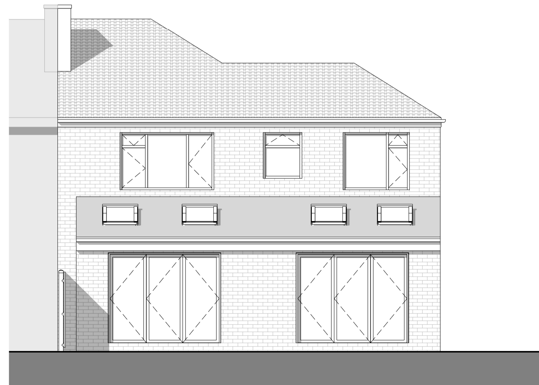
Existing Elevations - North-West