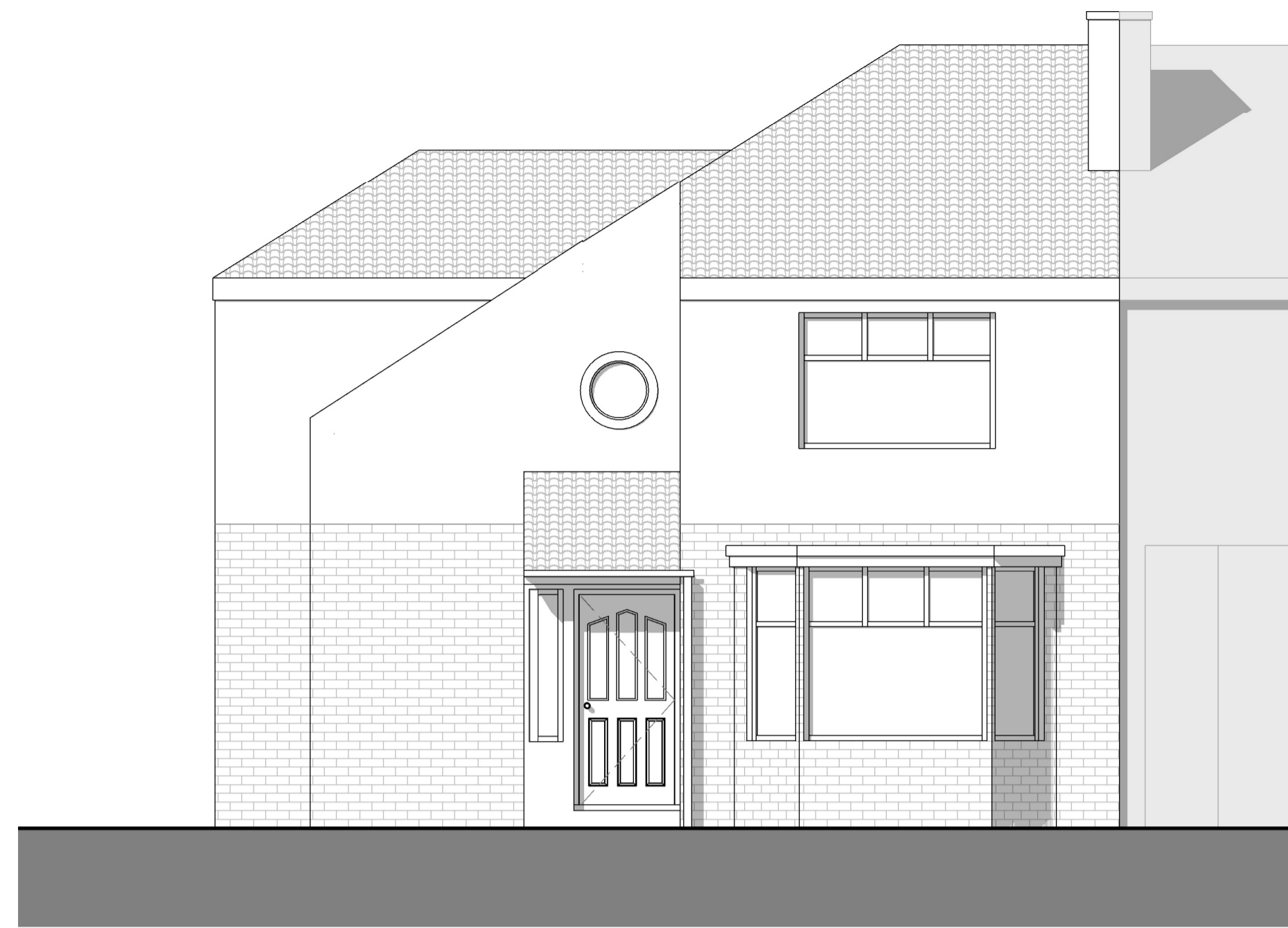
Existing Elevations - South-East