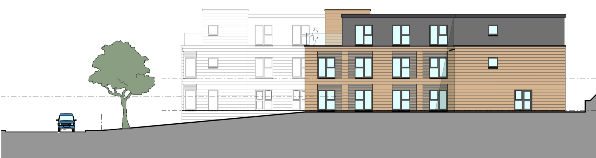
04 East Elevation 1:200