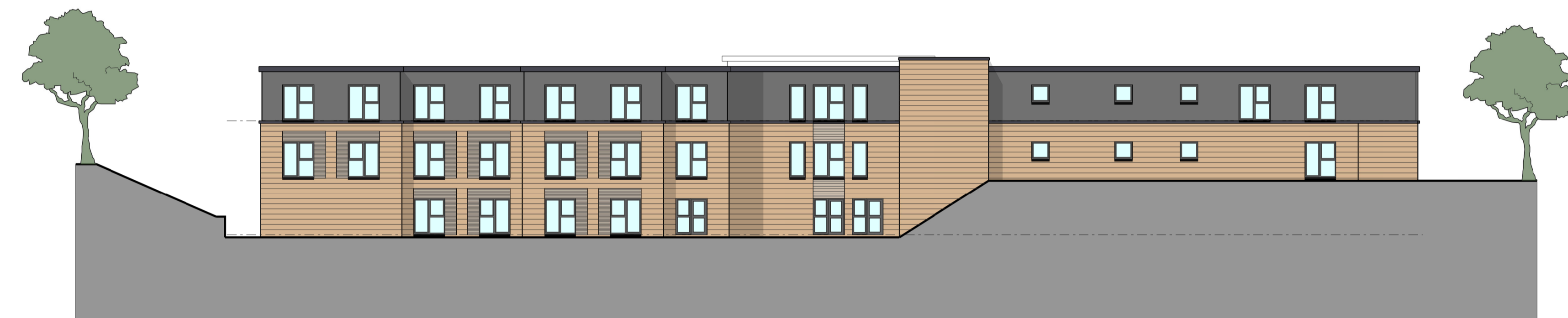
05 North Elevation 1:200