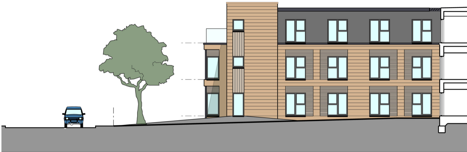
01 West Courtyard Elevation 1:200