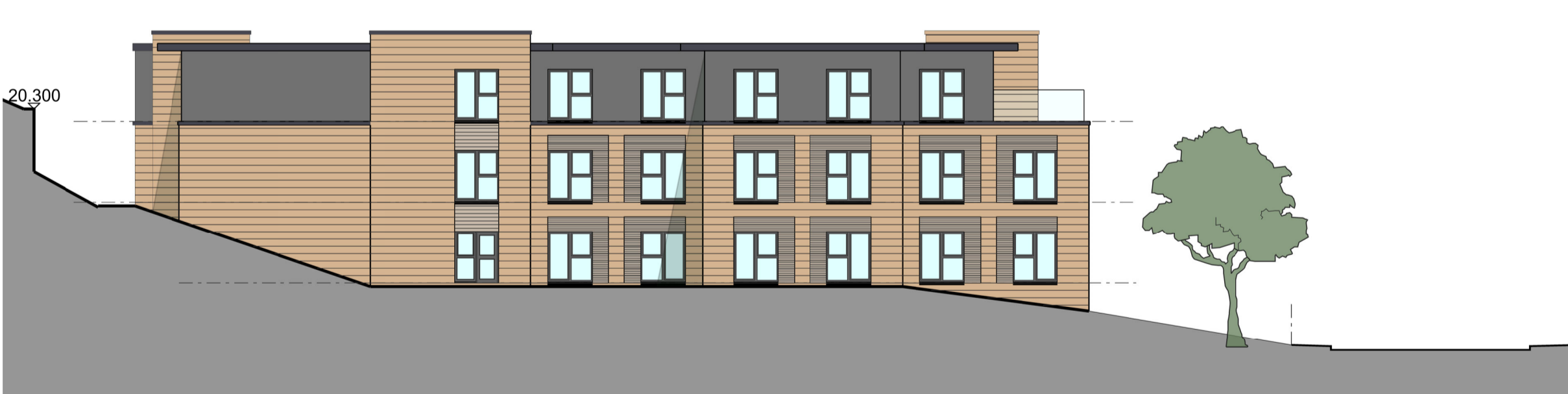
06 West Elevation 1:200