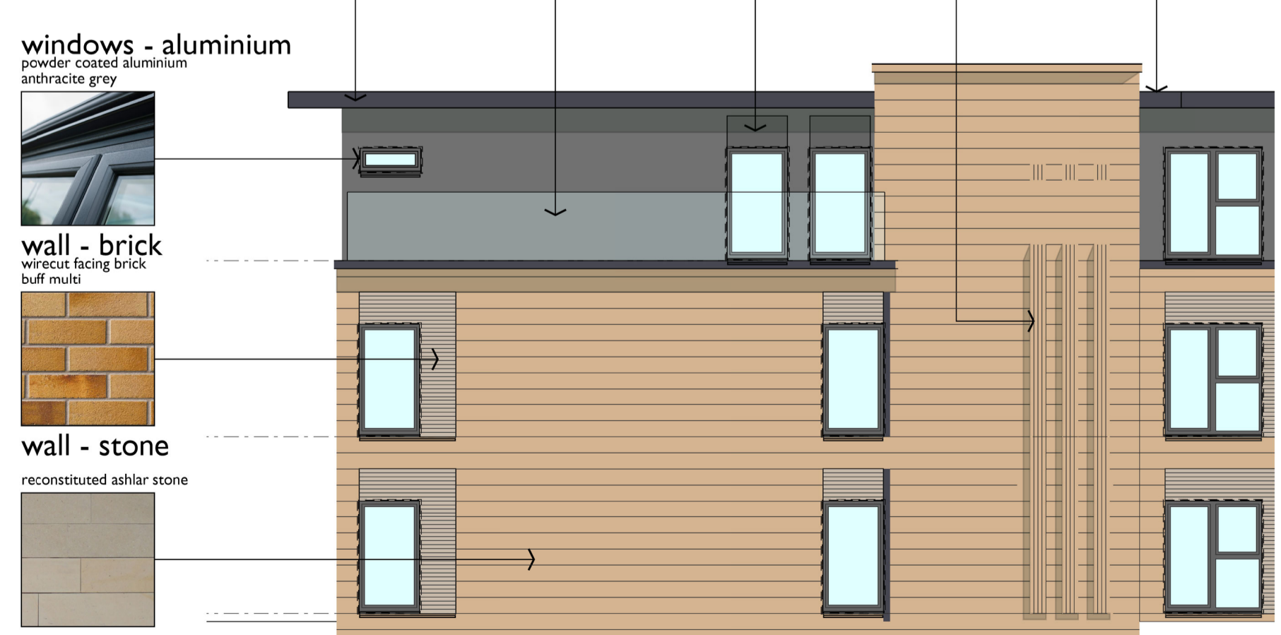
07 Materials Key nts