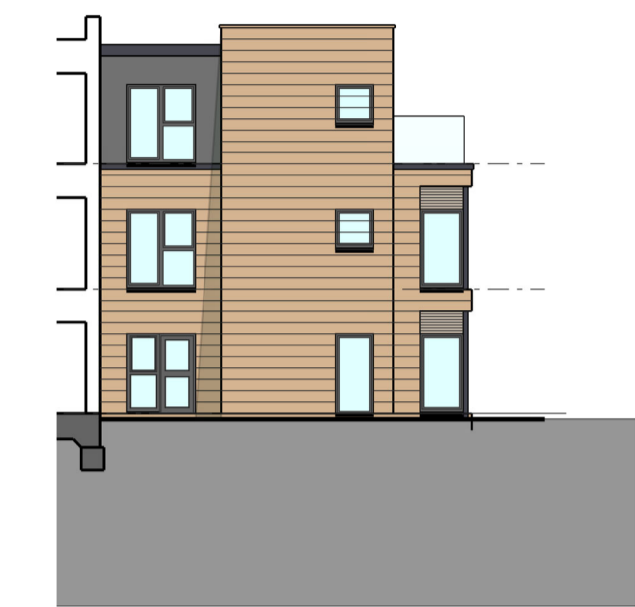
03 East Courtyard Elevation 1:200