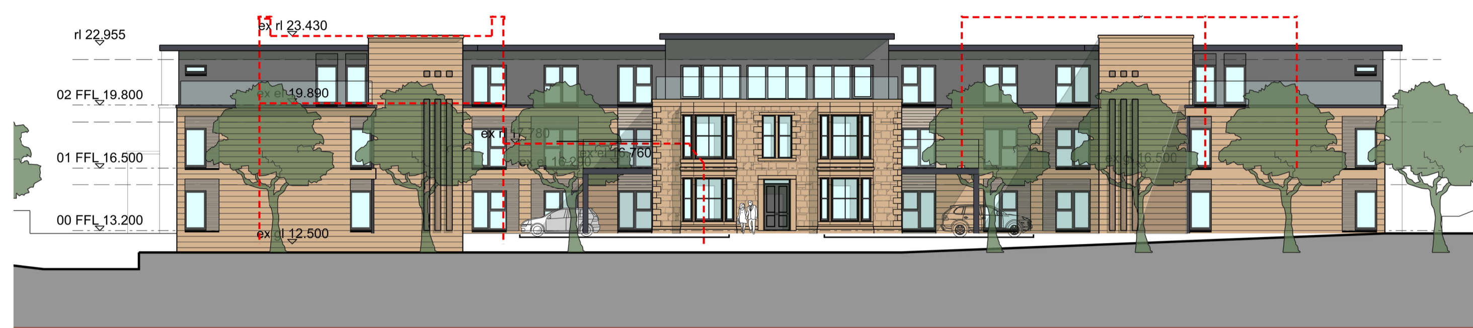
02 South Elevation 1:200