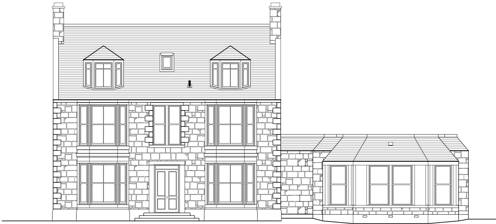
01 Existing South Elevation Scale 1:100