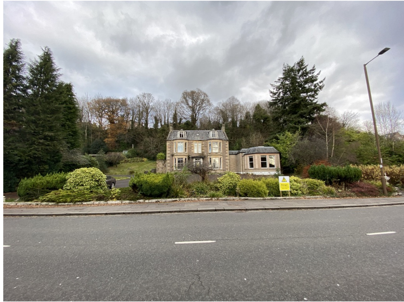
03 Existing South Elevation (Photo) Scale 1:100