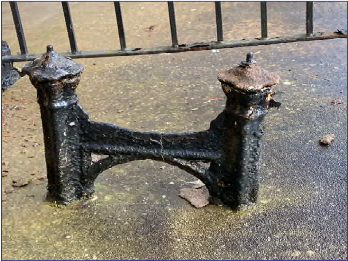
Plate 13: No.103 Henderson Street (Site 32), detail of boot scraper by the front entrance