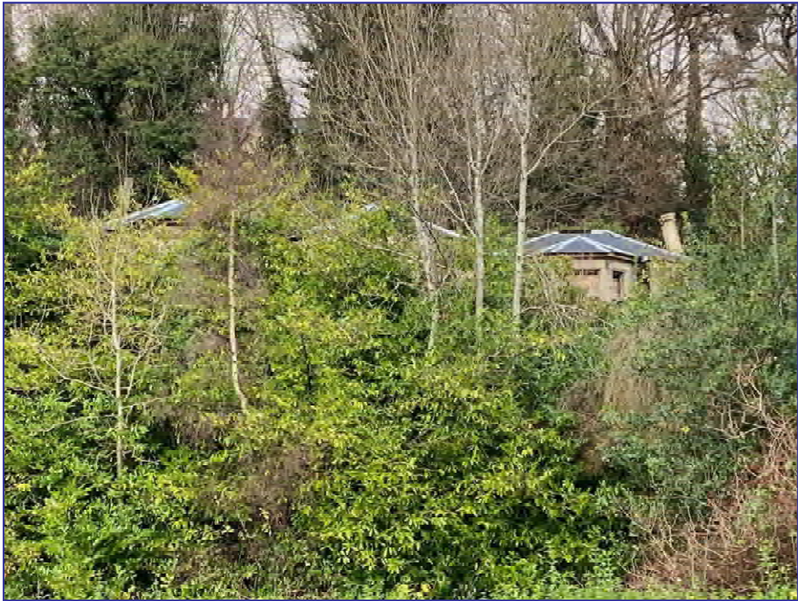
Plate 7: North facing view of of No.105 Henderson Street (Site 90) from the street front