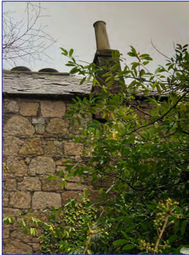
Plate 5: Structural damage to the WSW gable of No.105 Henderson Street (Site 90)