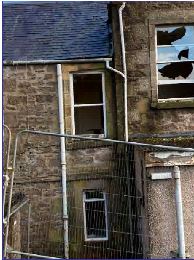
Plate 9: ESE facing view of No.103 Henderson Street (Site 32)