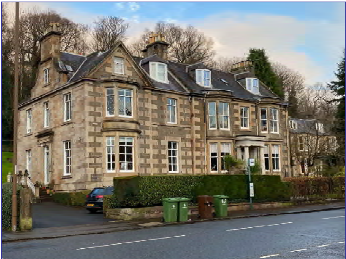
Plate 14: East facing view of Category C Listed Woodland House and Darnley House (Sites 30-31) with No.103 Henderson Street (Site 32) visible to the rear.