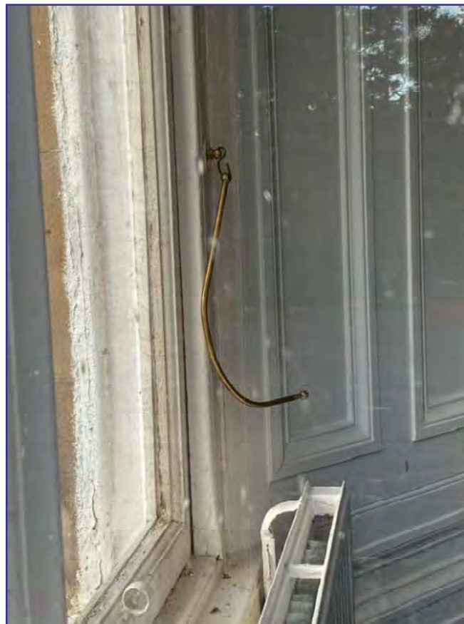
Plate 12: View of interior fittings and panelling within No.103 Henderson Street (Site 32)