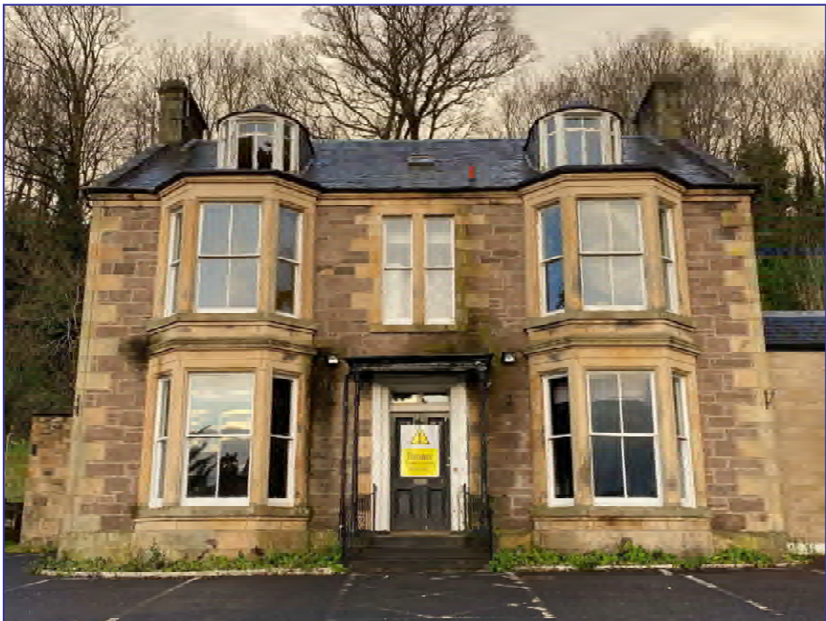
Plate 8: NNE facing view of No.103 Henderson Street (Site 32)