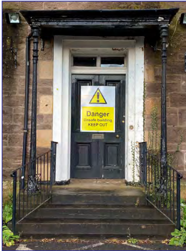
Plate 3: NNE facing close up of doorway to No.103 Henderson Street (Site 32)