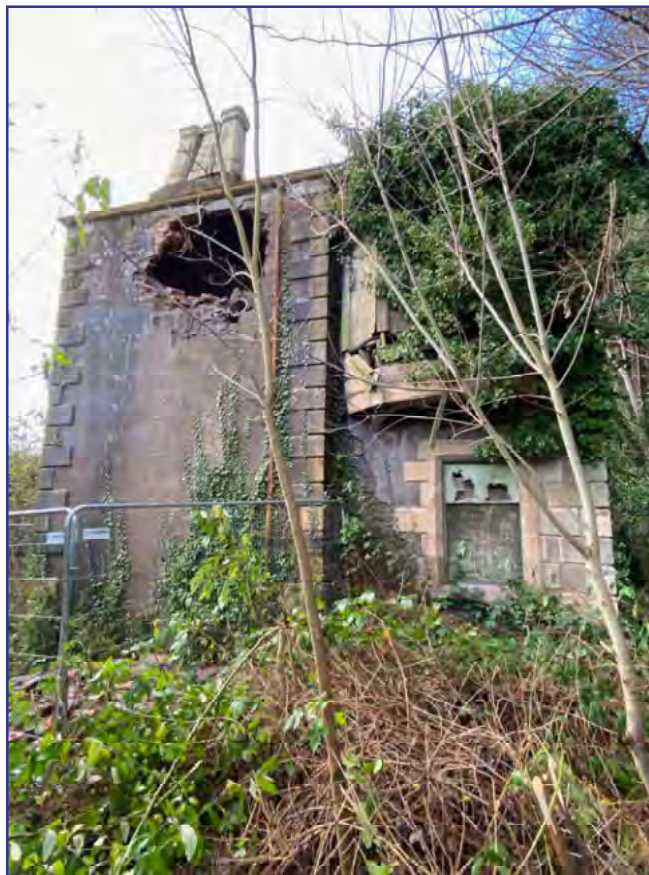
Plate 6: Structural damage to the ESE gable of No.105 Henderson Street (Site 90)