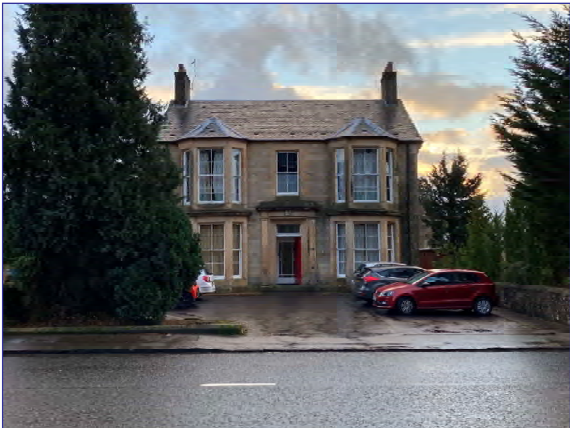
Plate 16: South facing view of Category B Listed Florence Villa (Site 44)