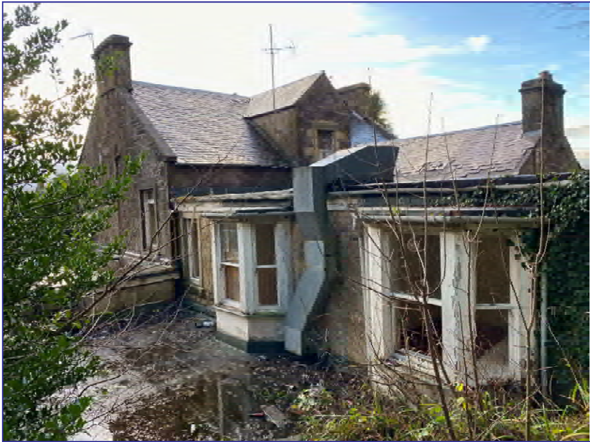
Plate 11: Southwest facing view of No.103 Henderson Street (Site 32)