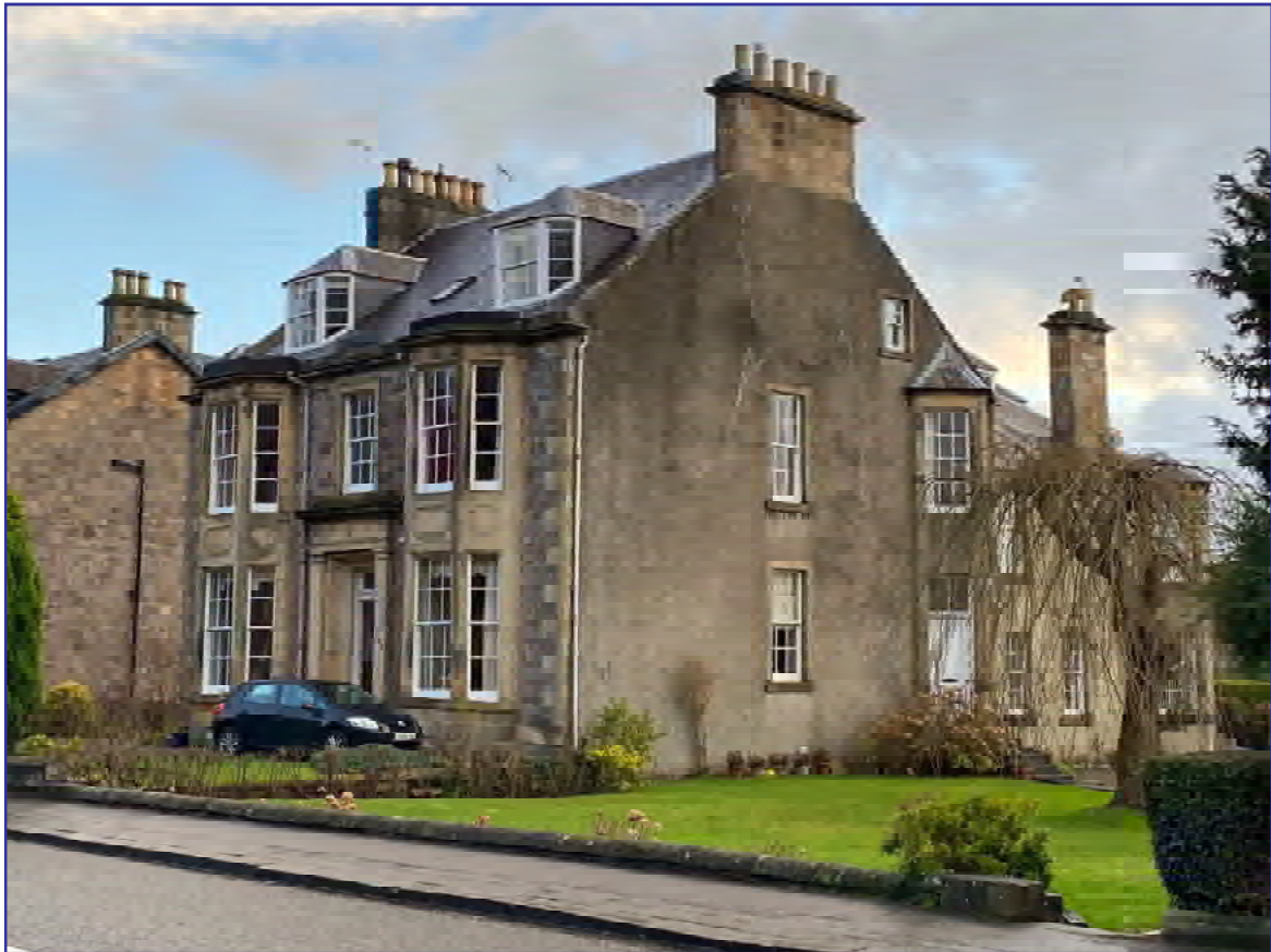
Plate 15: Southeast facing view of Category B Listed Kelvingrove (Site 45)