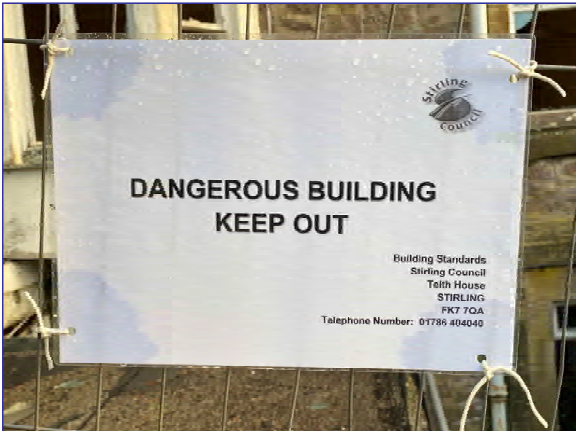
Plate 4: Hazard Sign within the curtilage of No.103 Henderson Street (Site 32)