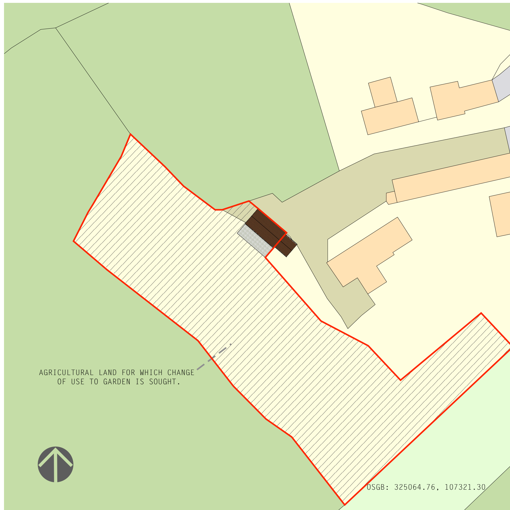
SITE PLAN. SCALE 1:500

PROJECT BARN CONVERSION YARCOMBE NAME: TYZACK ADDRESS: MOORPIT FARM, YARCOMBE, EX14 9BG.