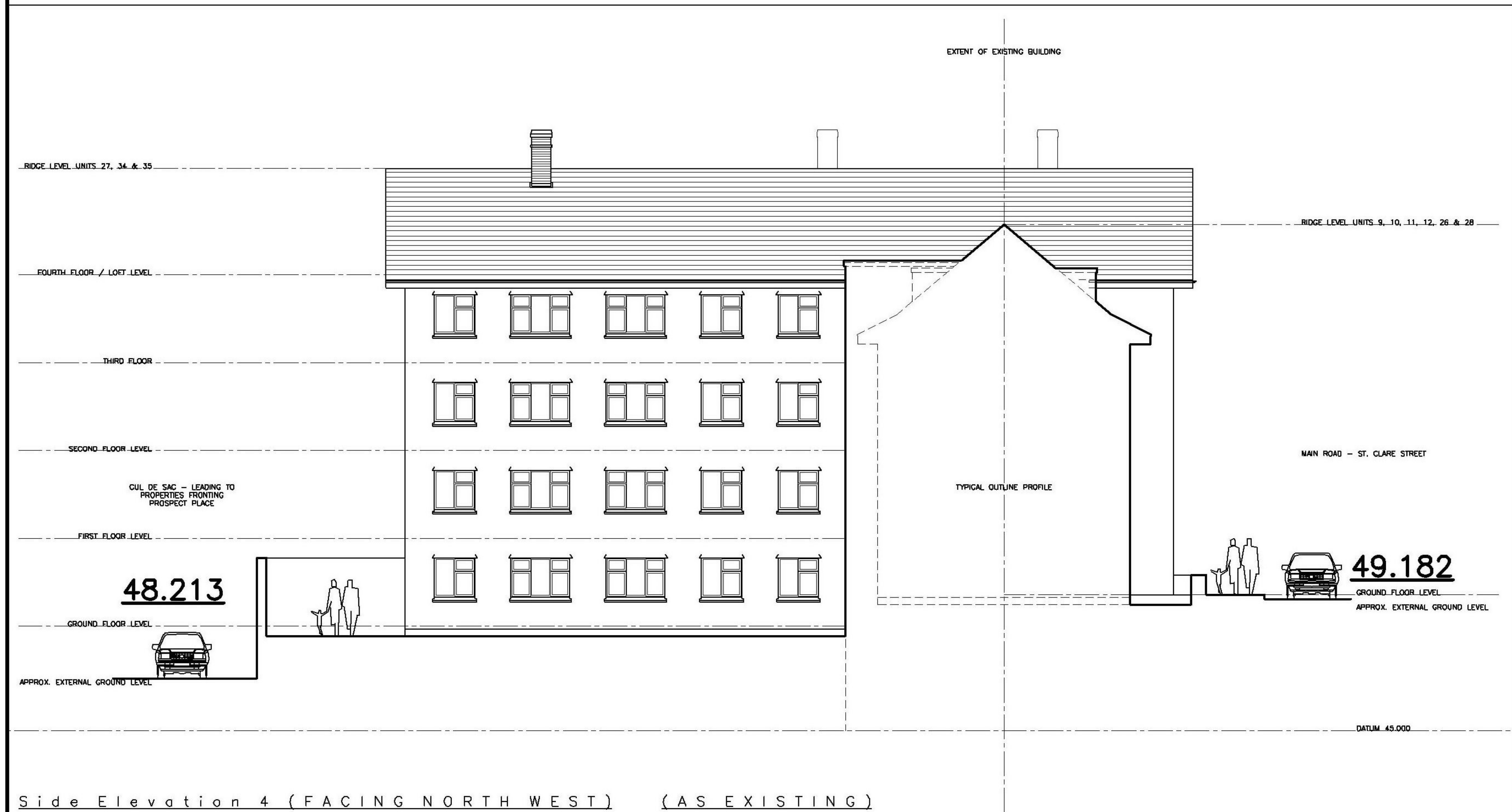
Side Elevation 4 (FACING NORTH WEST) (AS EXISTING)