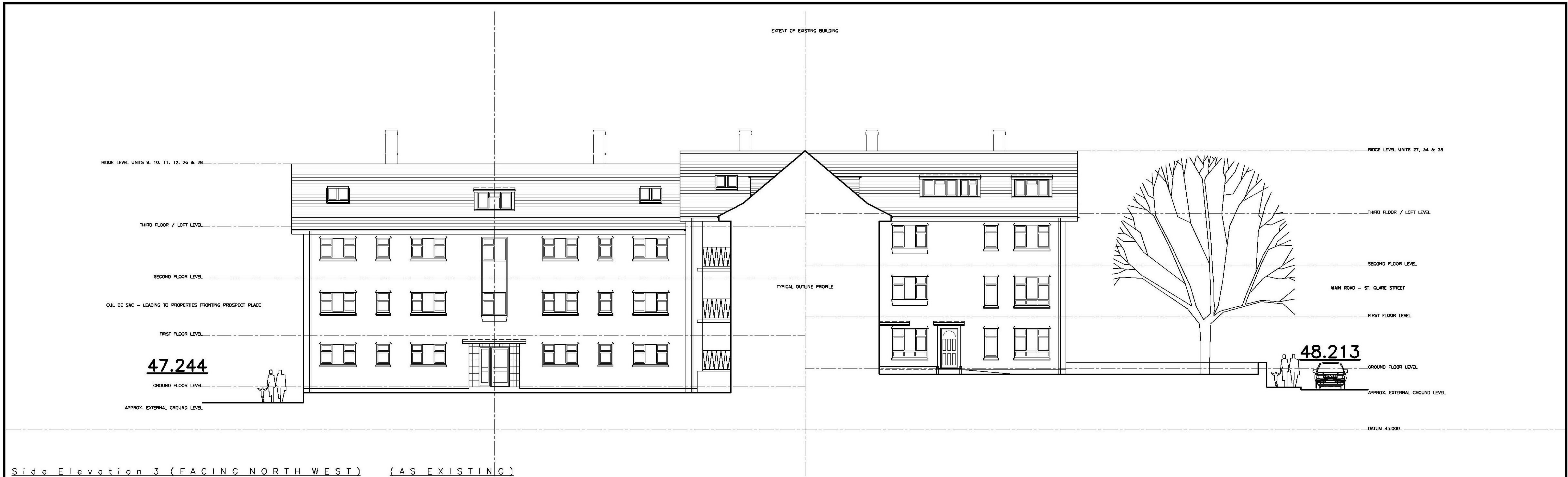
Side Elevation 3 (FACING NORTH WEST) (AS EXISTING)