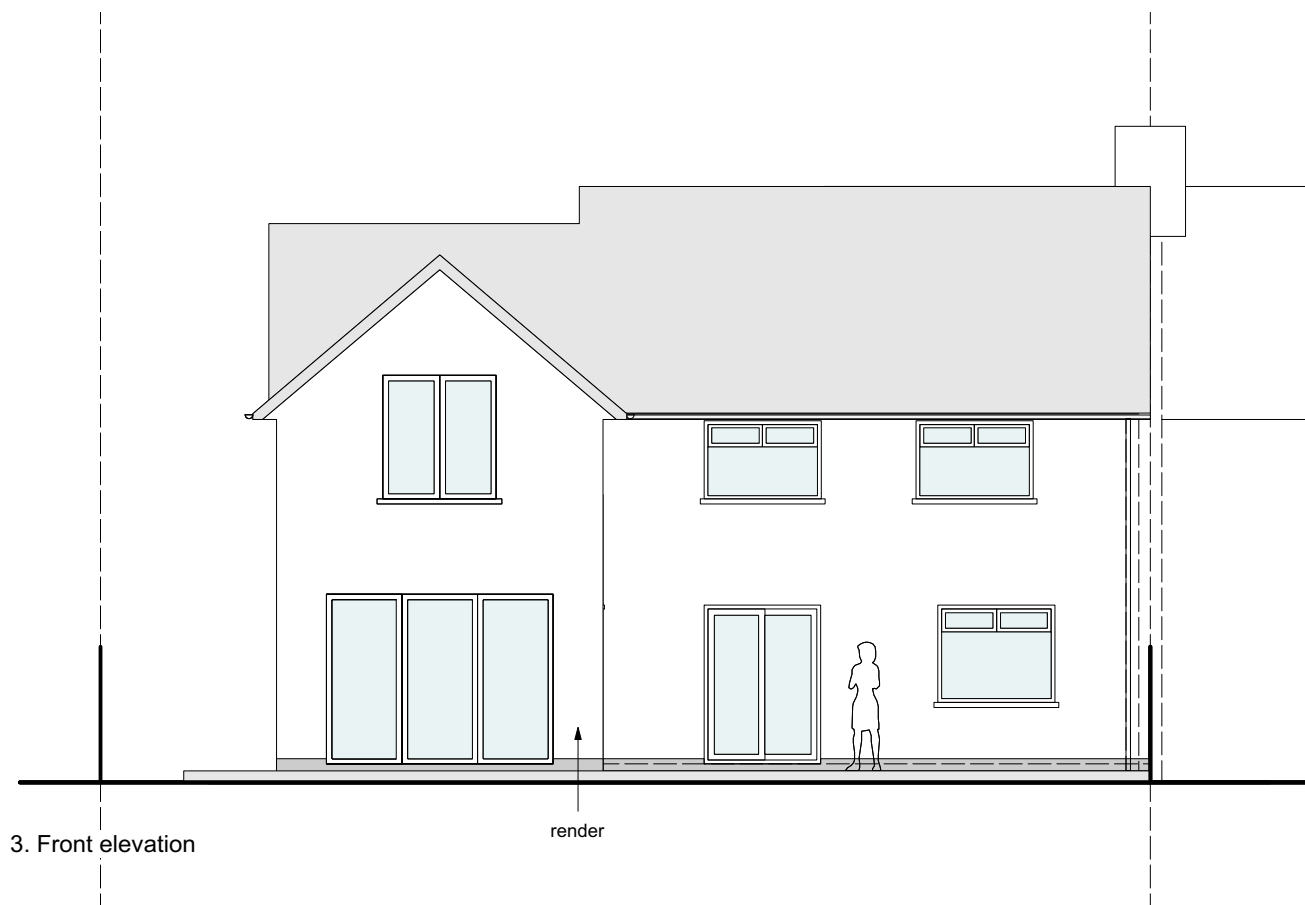
3. Front elevation