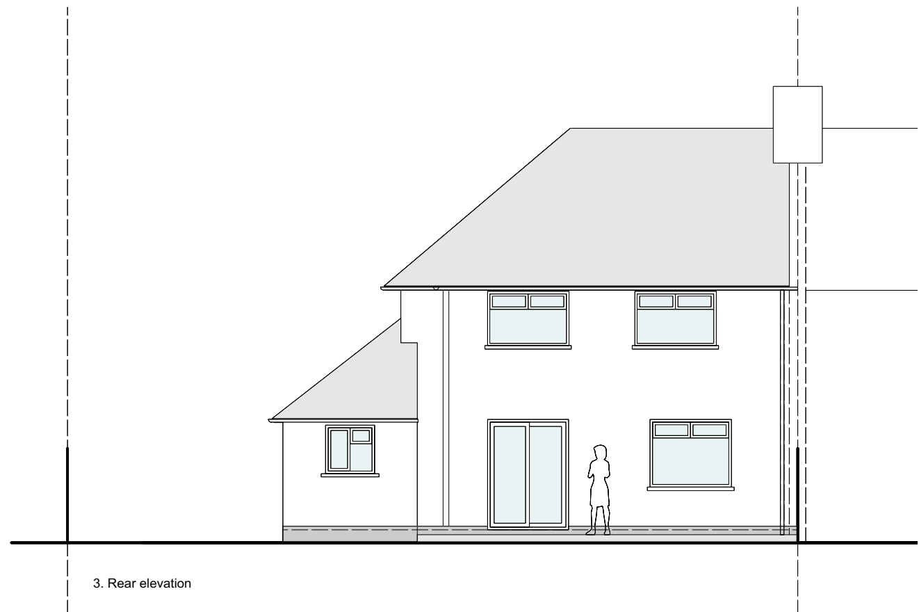
3. Rear elevation