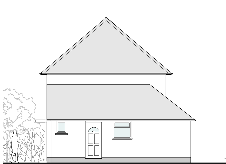
2. Side elevation