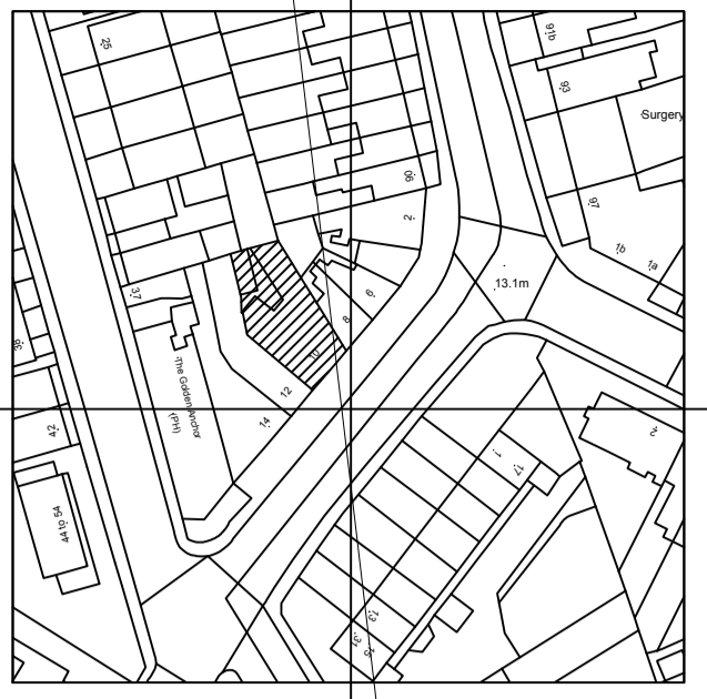
O.S. SITE LOCATION PLAN 1 : 1250 @ A1