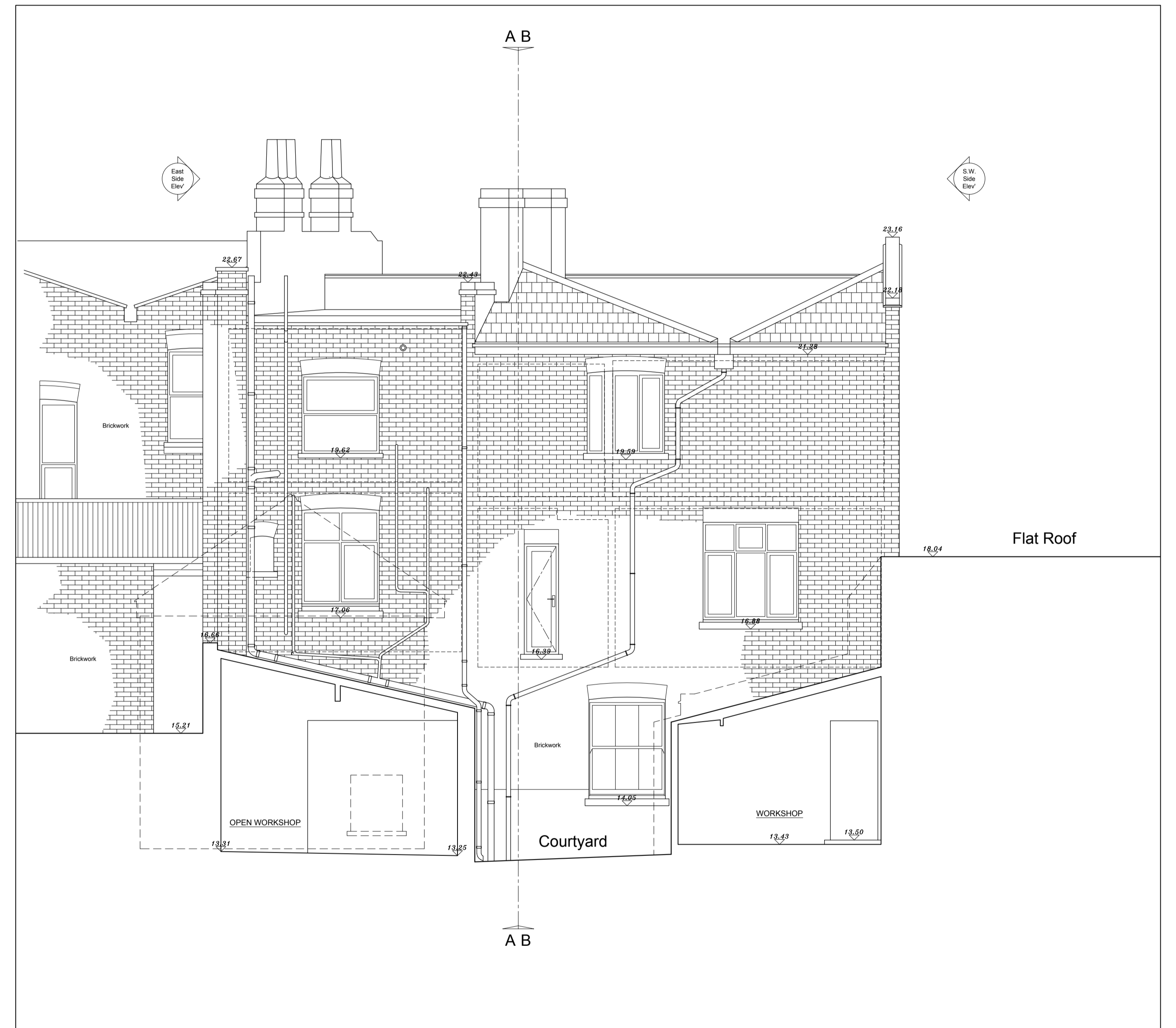
02 Back Elevation 01-104 SCALE 1:50

The drawings and the design hereon is the copyright of Milan Babic Architects Ltd and must not be reproduced without their written consent.