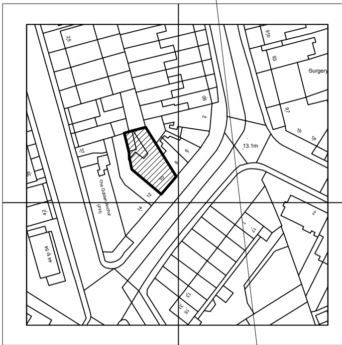
O.S. SITE LOCATION PLAN 1 : 1250 @ A1