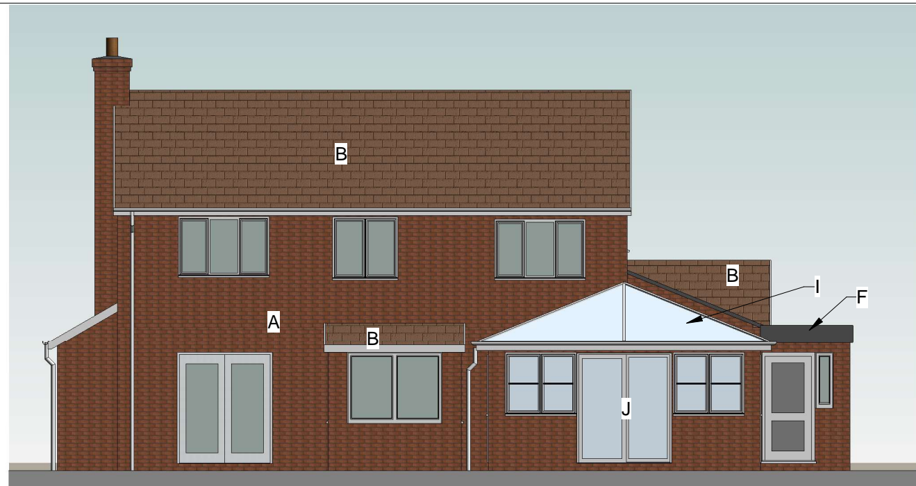
Existing Rear Elevation 1 : 100