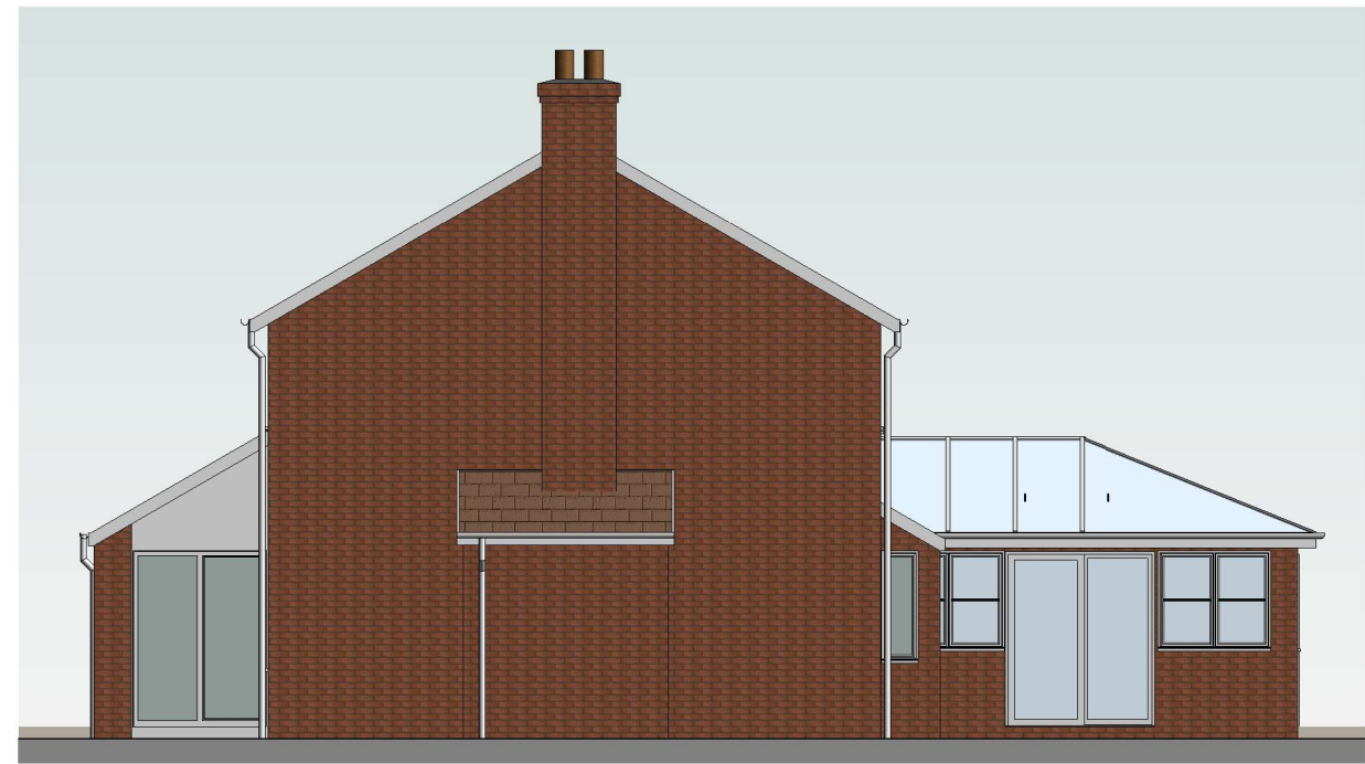
Existing Side Elevation R 1 : 100