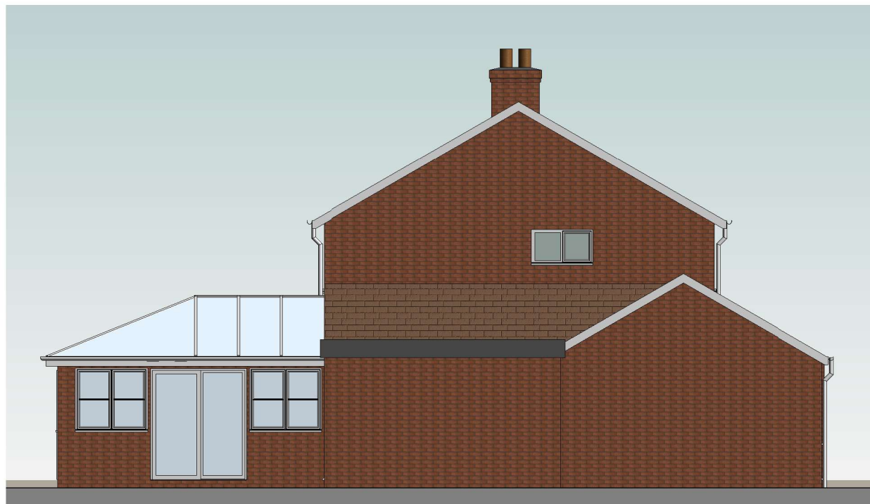
Existing Side Elevation L 1 : 100