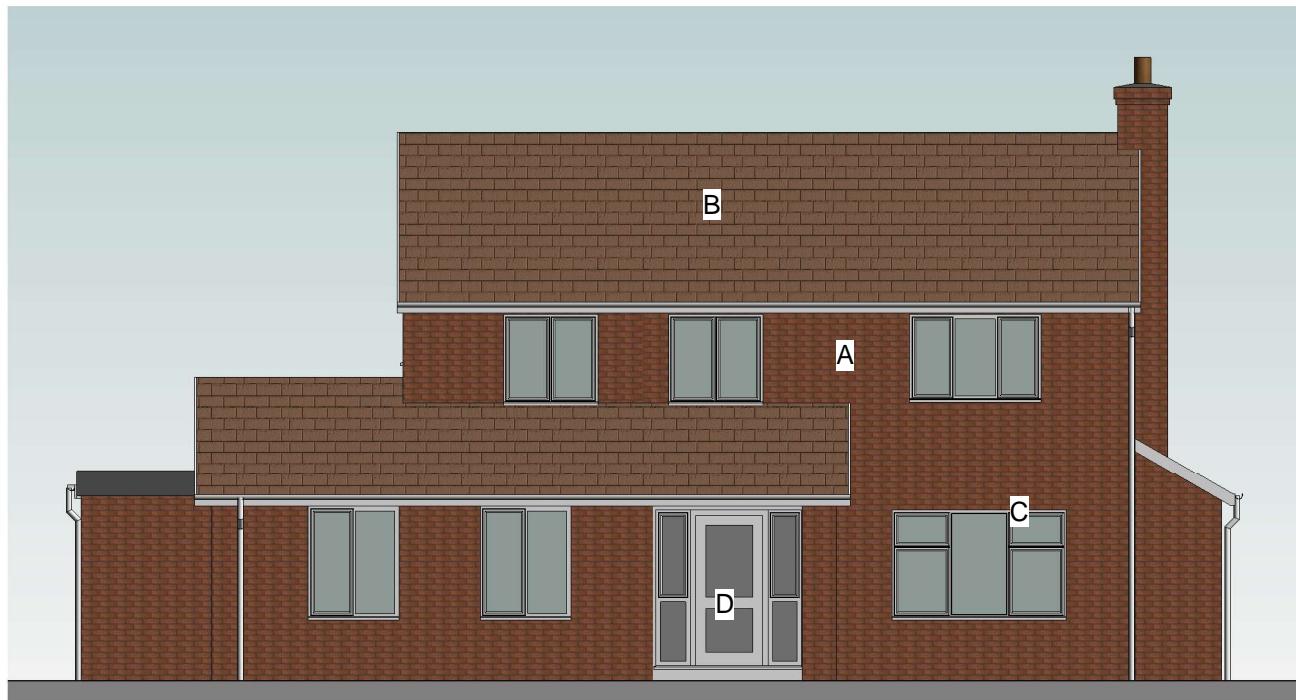
Proposed Front Elevation 1 : 100