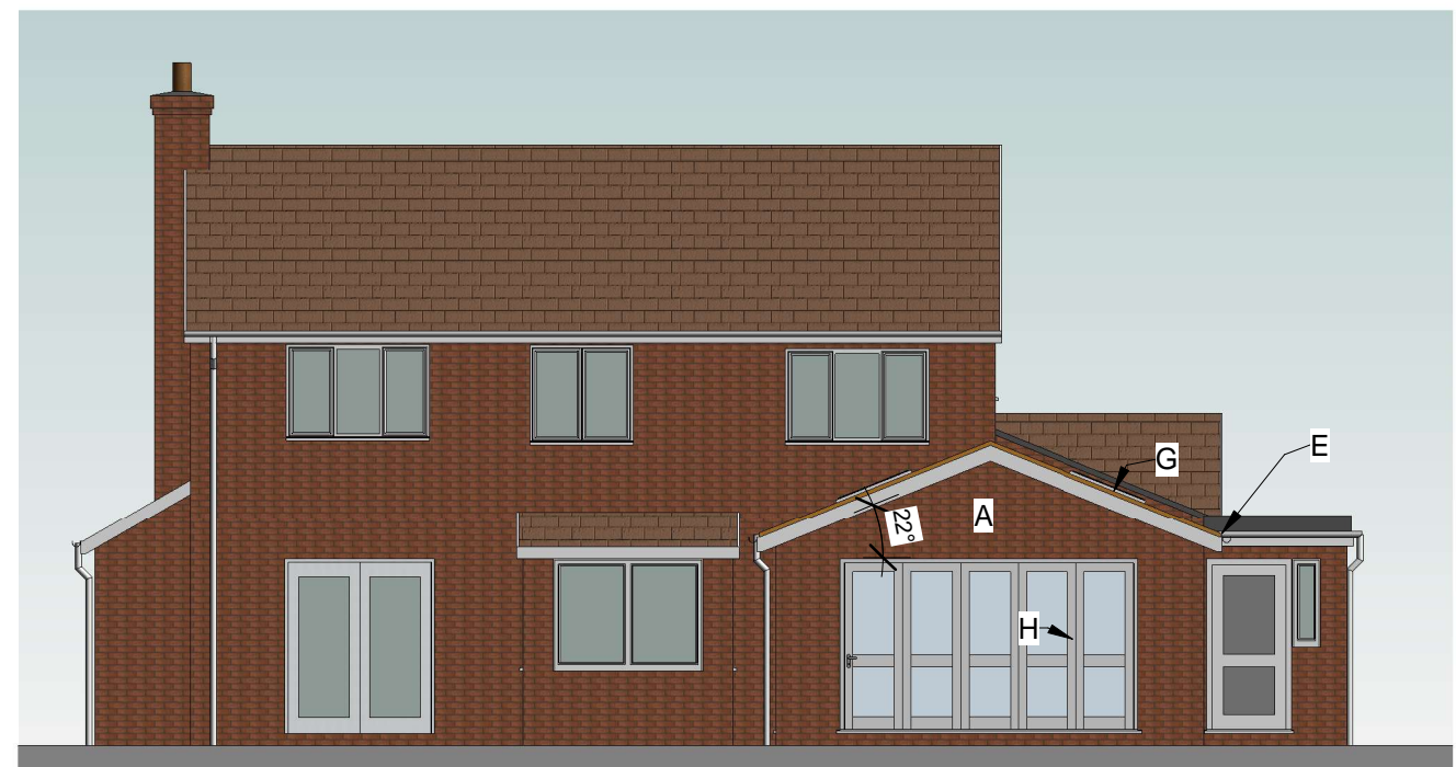
Proposed Rear Elevation 1 : 100