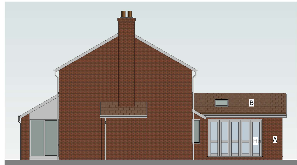
Proposed Side Elevation R 1 : 100