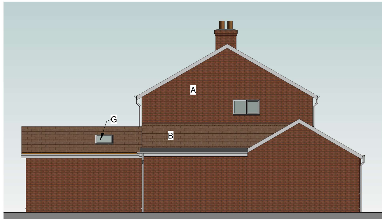
Proposed Side Elevation L 1 : 100