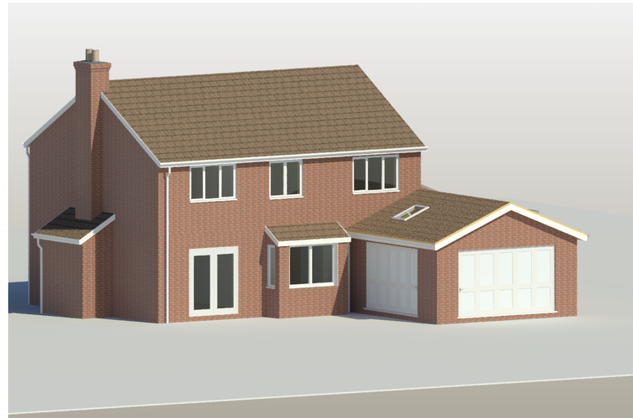
Proposed Family Room View