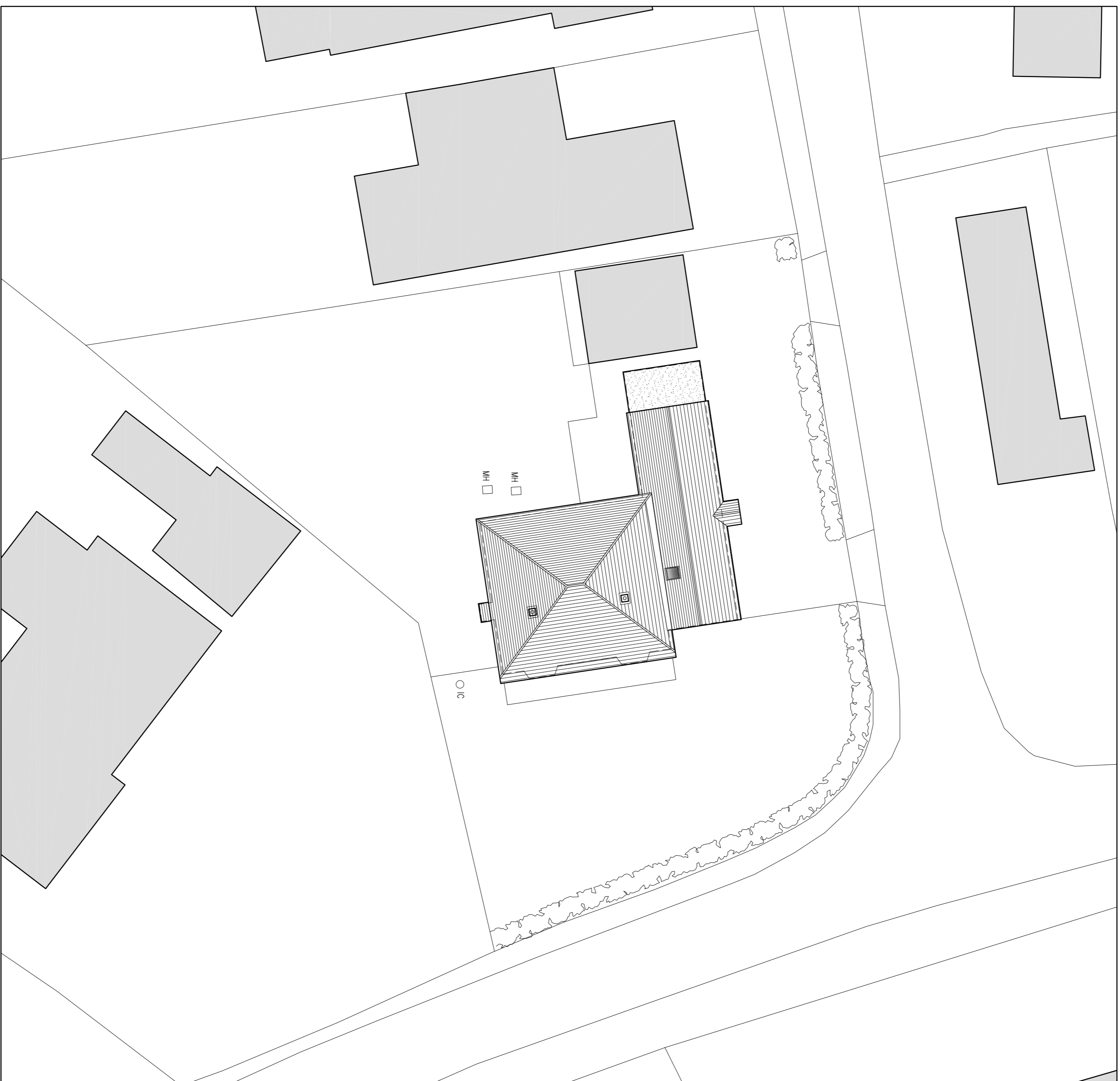
Existing Site Plan Scale: 1:200