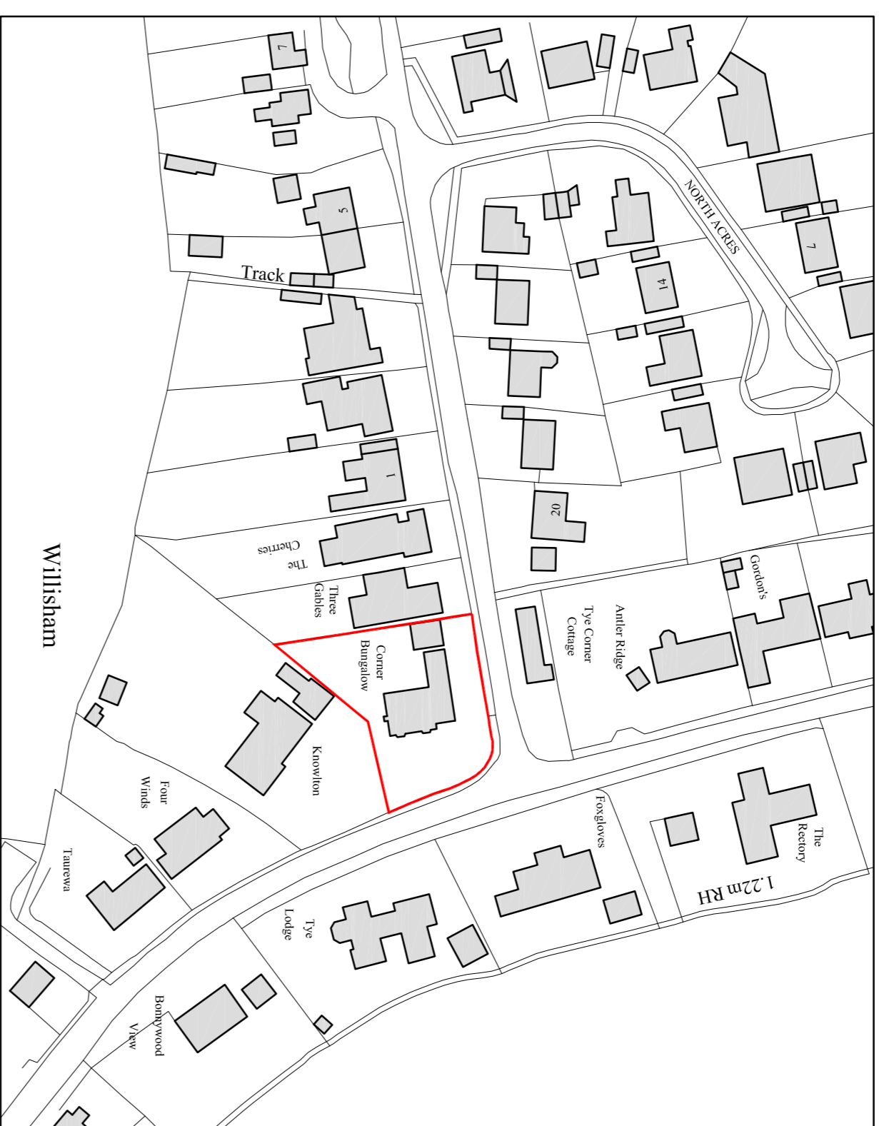
Location Plan Scale: 1:1250