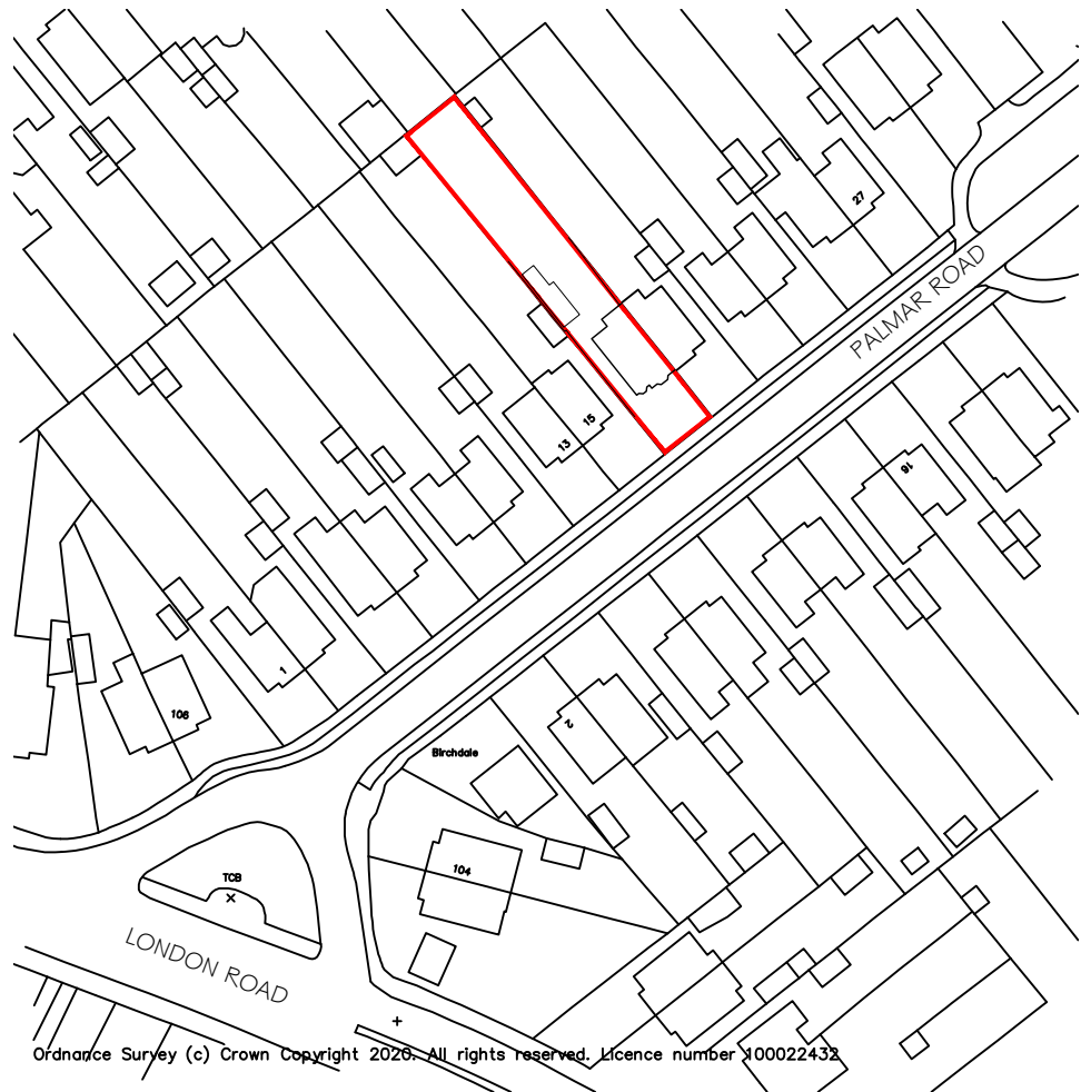
SITE LOCATION - as EXISTING (Scale 1:1250)