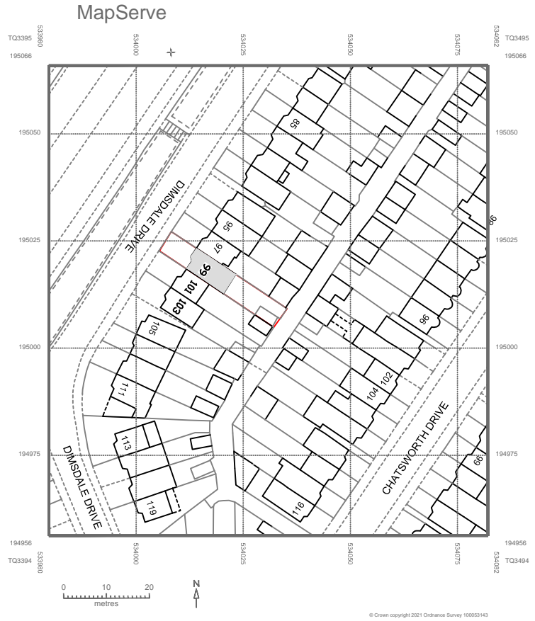
01 Location Plan 1:1250 (A3)