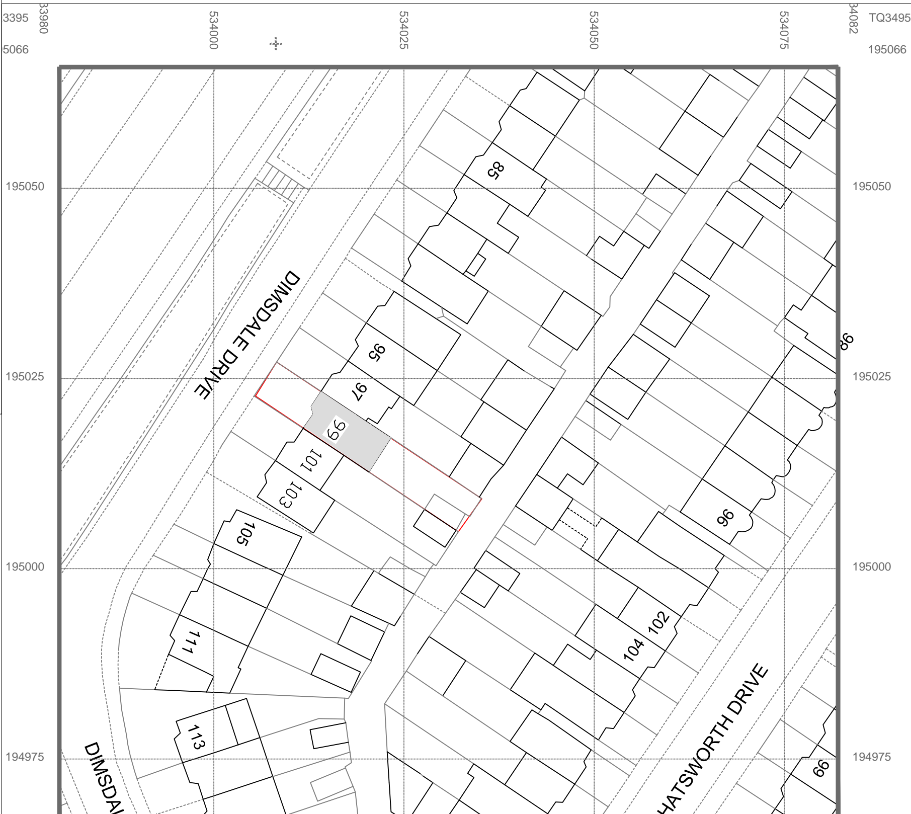
02 Location Plan 1:1500 (A3)