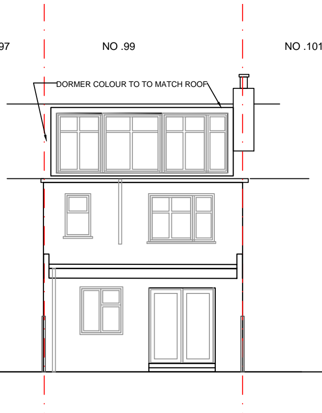
03 Proposed Rear Elevation 1:100 (A3)