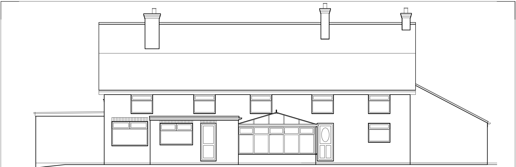
Front elevation facing north