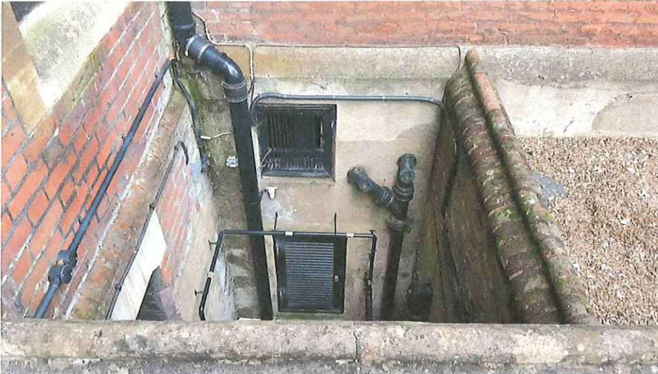
Entrance to the East Wing (dangerous low level parapet) RHS of entrance