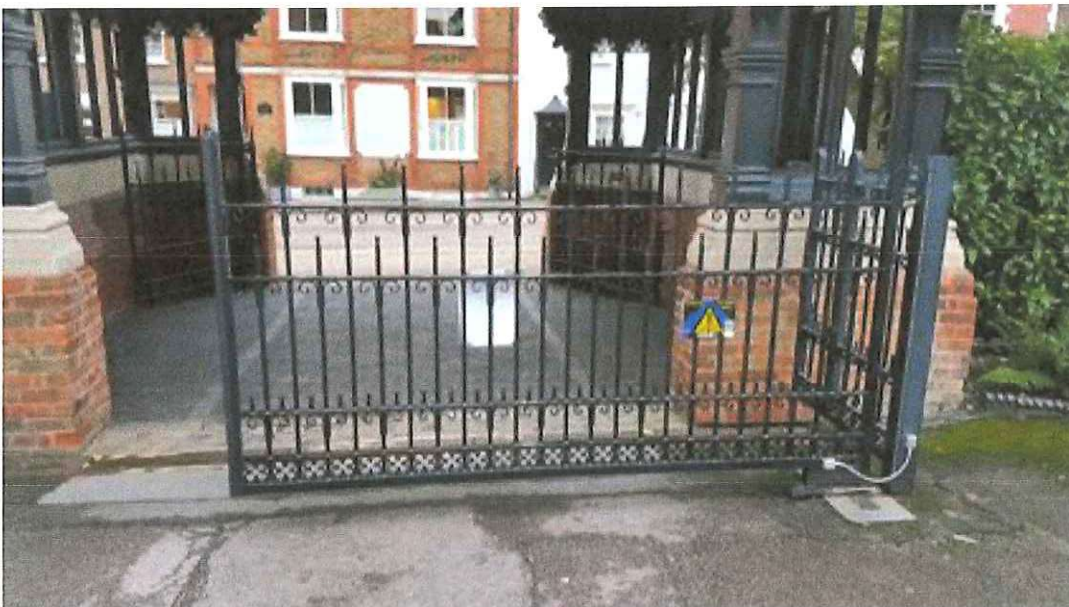
Current interpretation of the historic railing with safety in mind