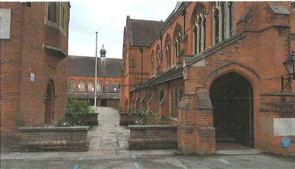
View to remembrance garden