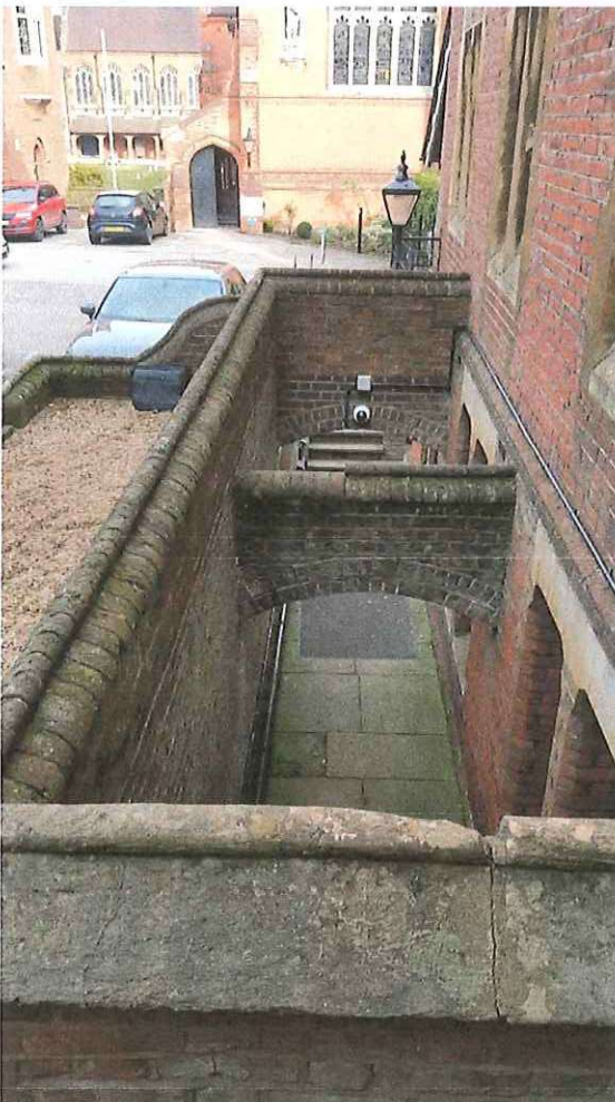
Entrance to the East Wing (dangerous low level parapet) LHS of entrance