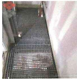
GRP Safety Limited Mesh Infill Panels (colour Black)