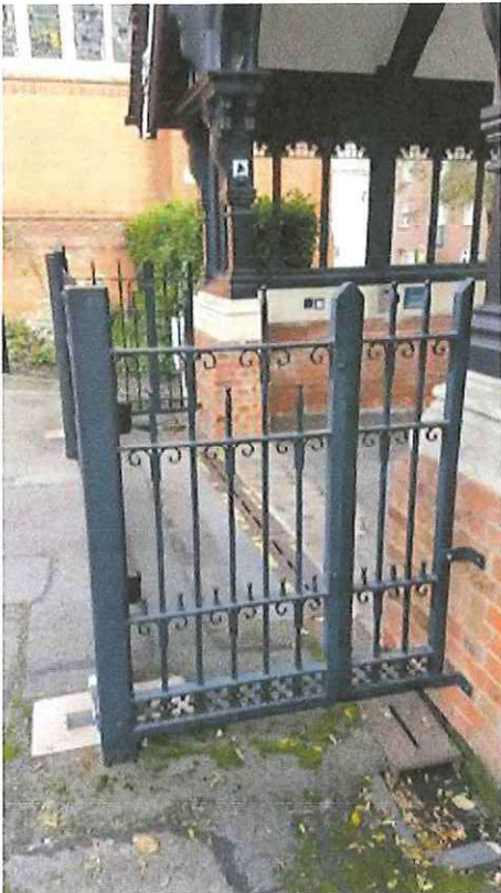
Current interpretation of the historic railing