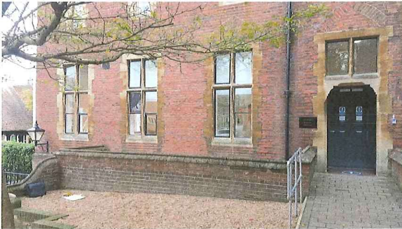
Entrance to the East Wing