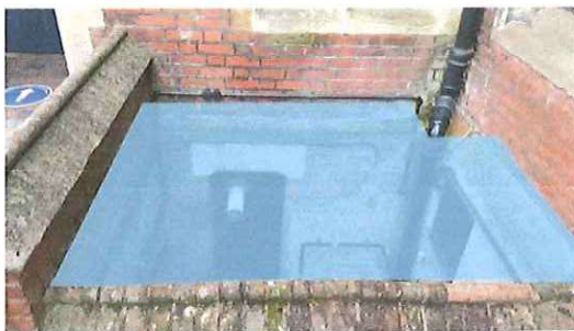
Safety Mesh Infill to protect against 3.3m drop East Wing - [Right of Entrance]