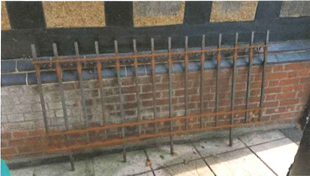
School mock-up of proposed railings for the remembrance garden (to be finished black)