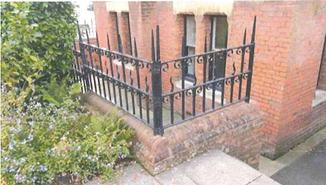
Historic Railings – [would prevent a current day health and safety issue]

B] Option 2 – To add metal railings to the top of the stone parapet to the whole area of the recess, to achieve a height of 1.1m with railings at 100mm centres to comply with Part K of the building regulations. This approach would require new railings to the full extent of the parapet stones. This approach would have more visual impact on the façade. The metal railings would be produced to reflect similar railings throughout the Castle Campus.