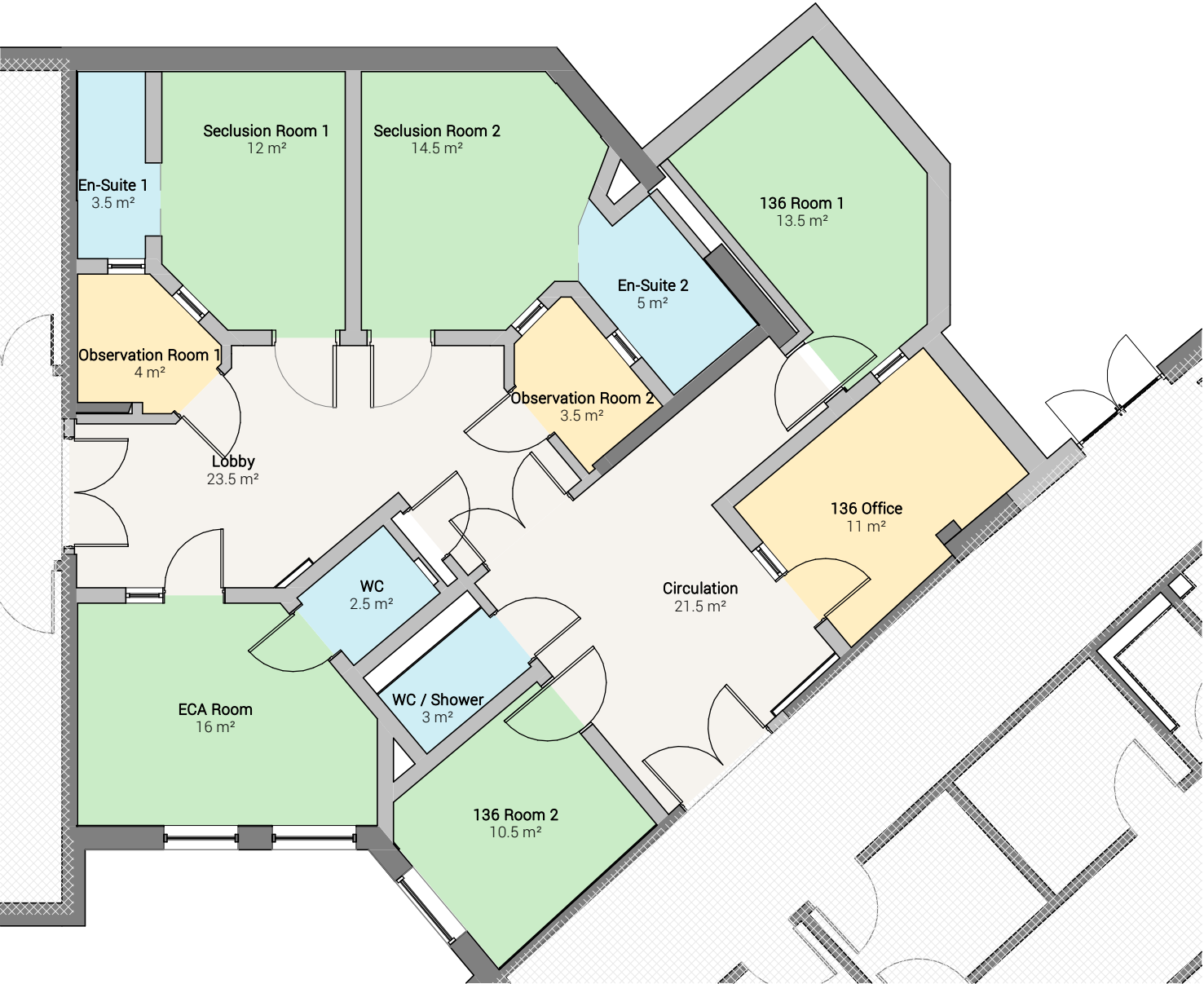
Proposed Plan - Keats Seclusion Suite 1 : 100