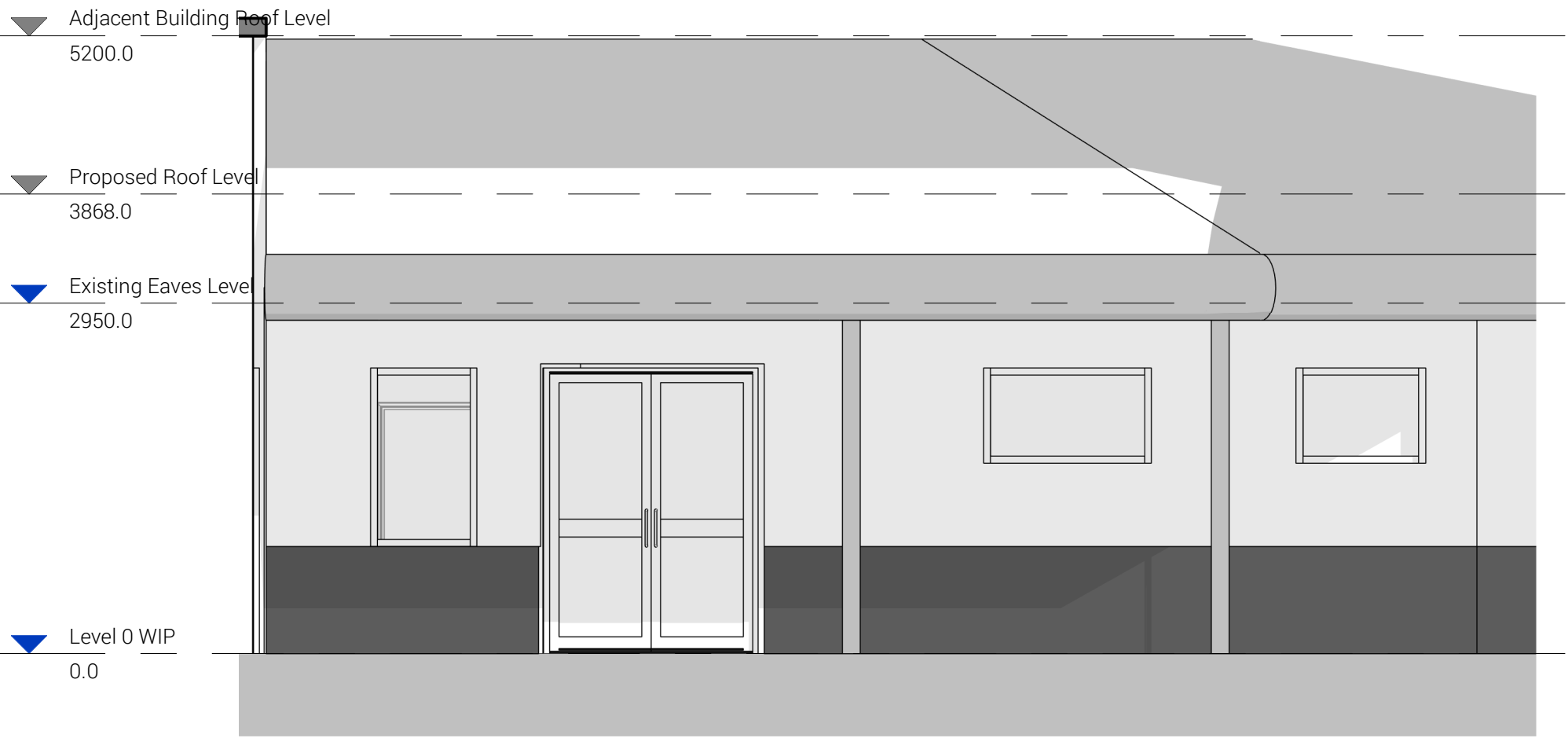
Existing Elevation 1 1 : 50