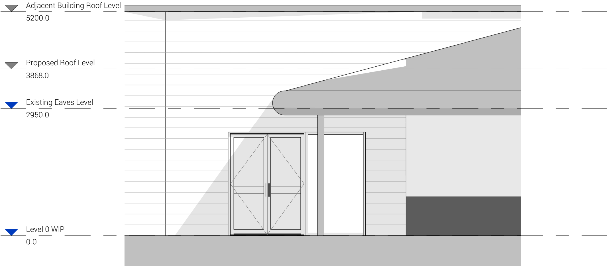
Existing Elevation 2 1 : 50