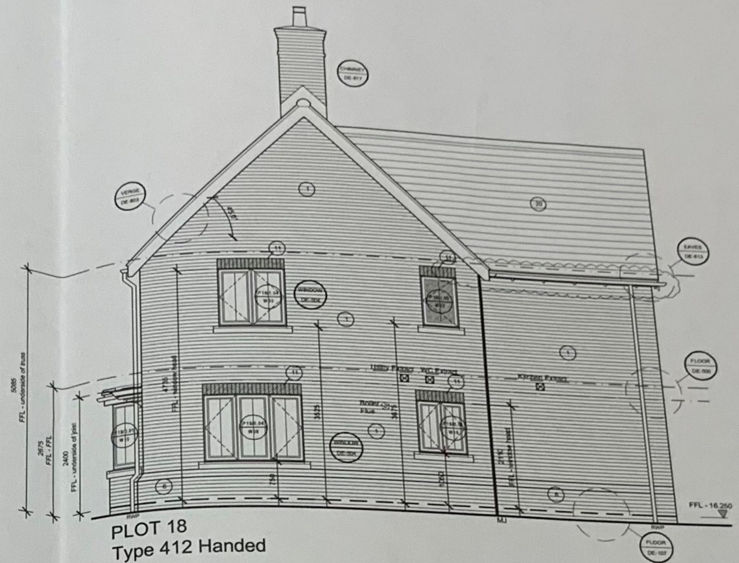
PLOT 18 Type 412 Handed