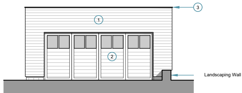
West Elevation (Front)