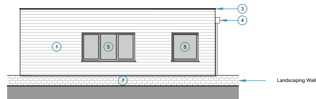
South Elevation (Side)