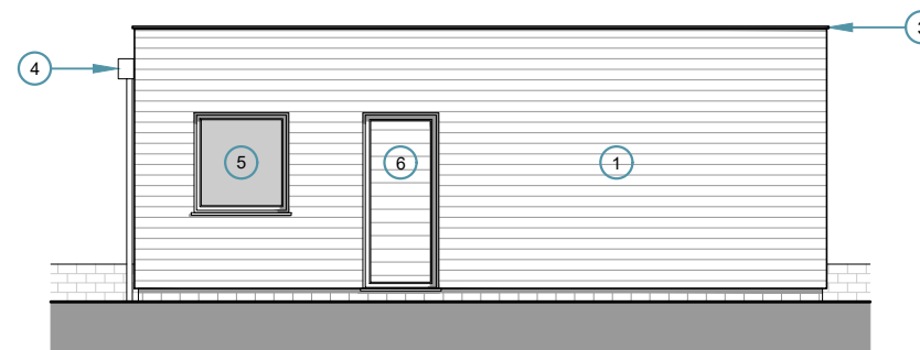
North Elevation (Side)