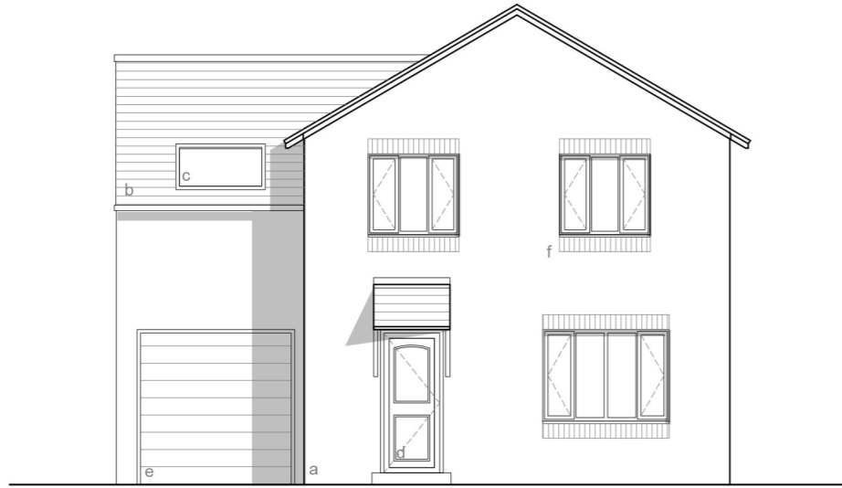
01 West - Front