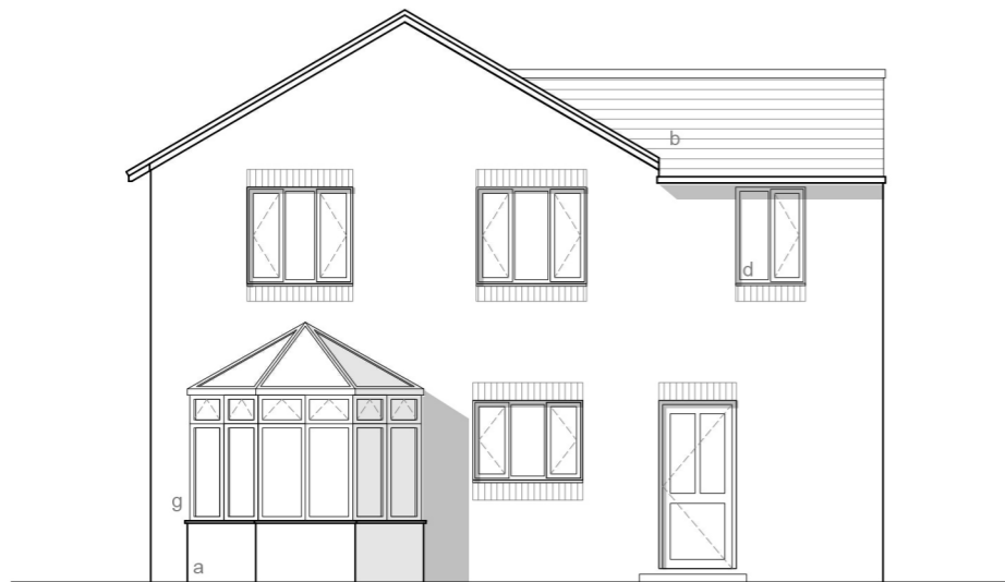
03 East - Rear