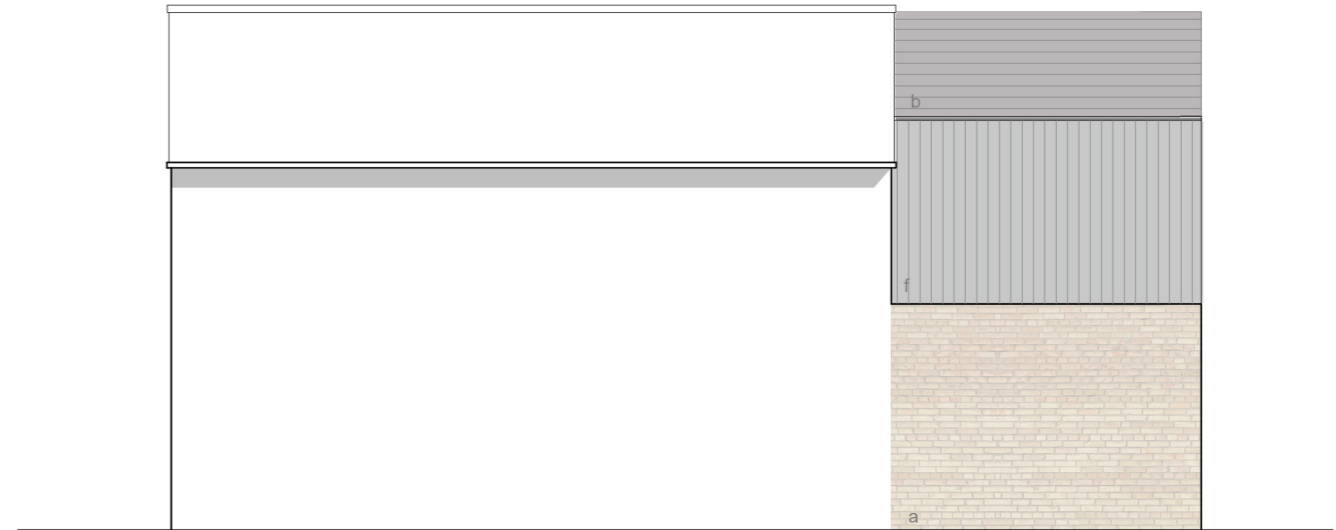
02 South - Side