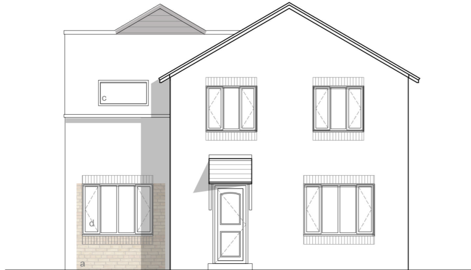
01 West - Front