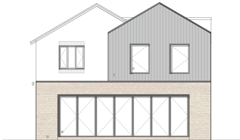
03 East - Rear