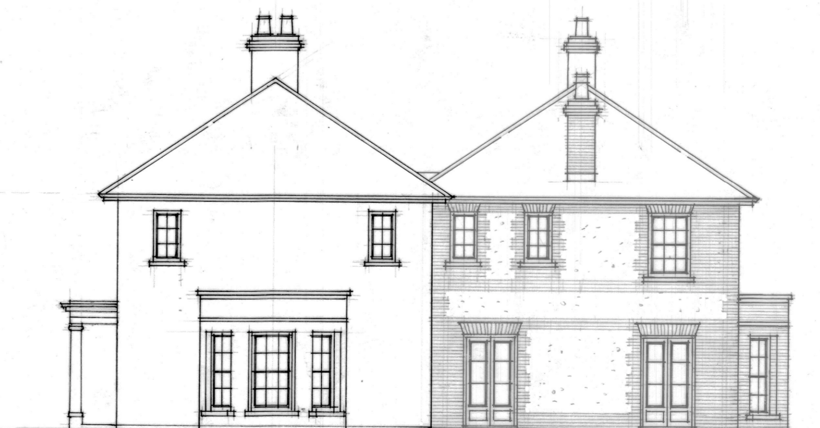
north west elevation