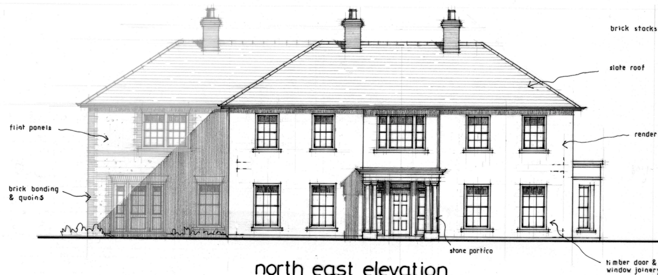
north east elevation