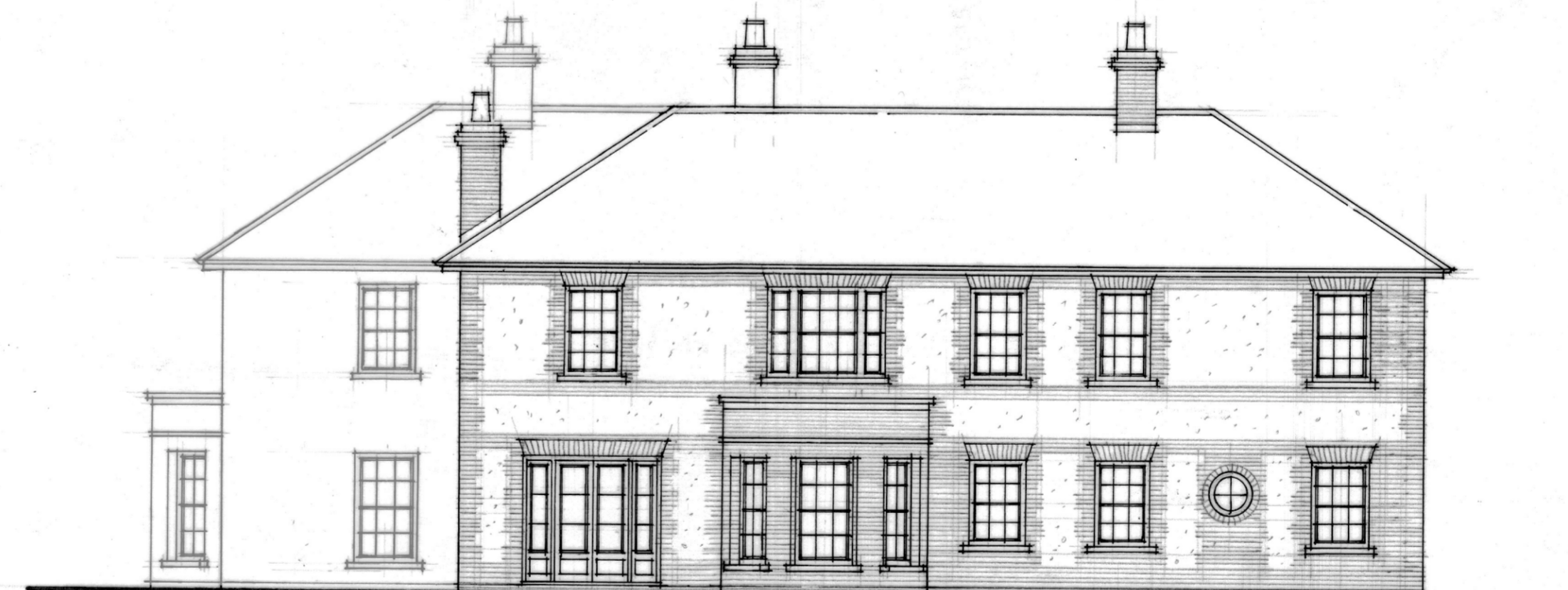
south west elevation