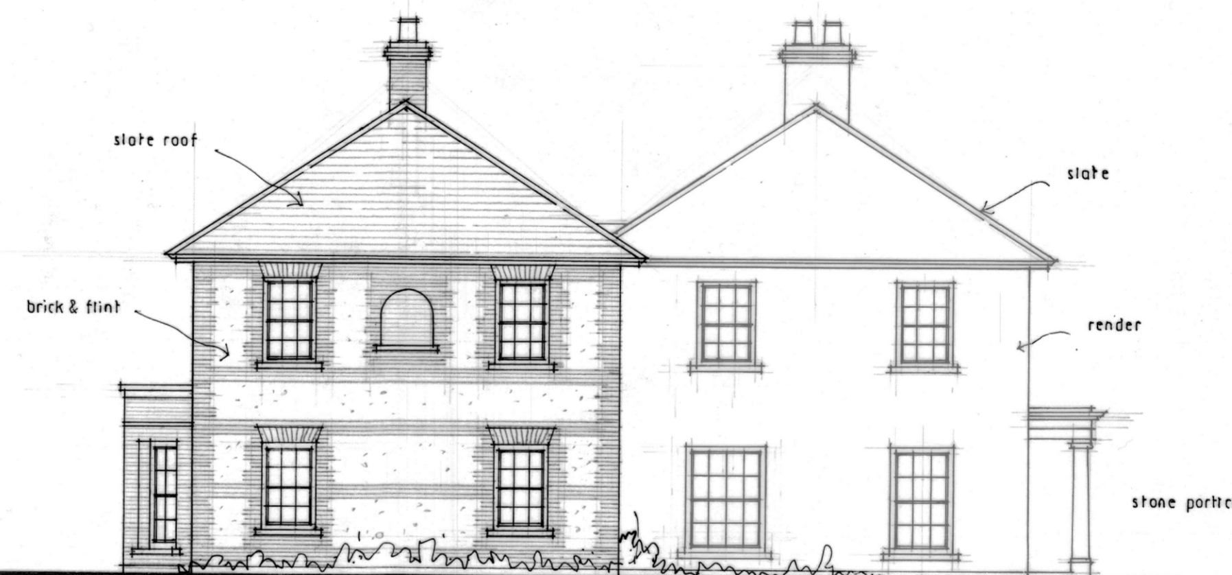
south east elevation