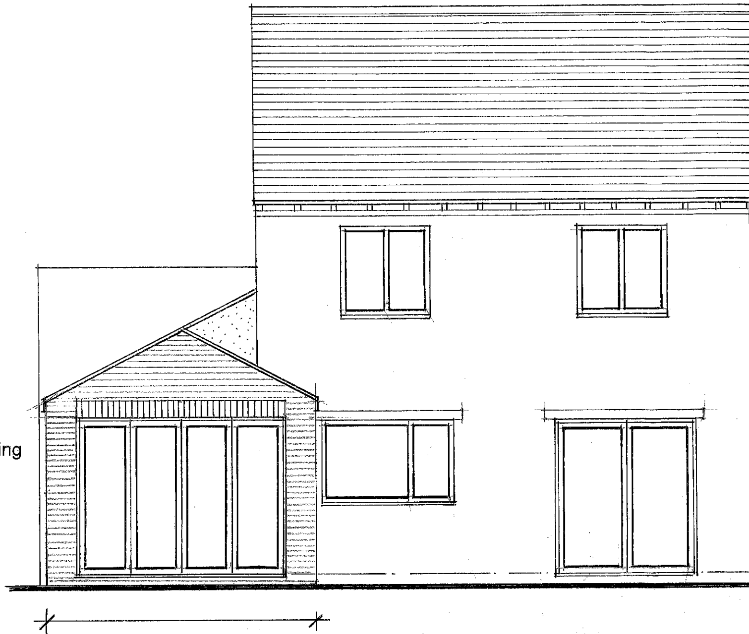
Rear Elevation as Proposed