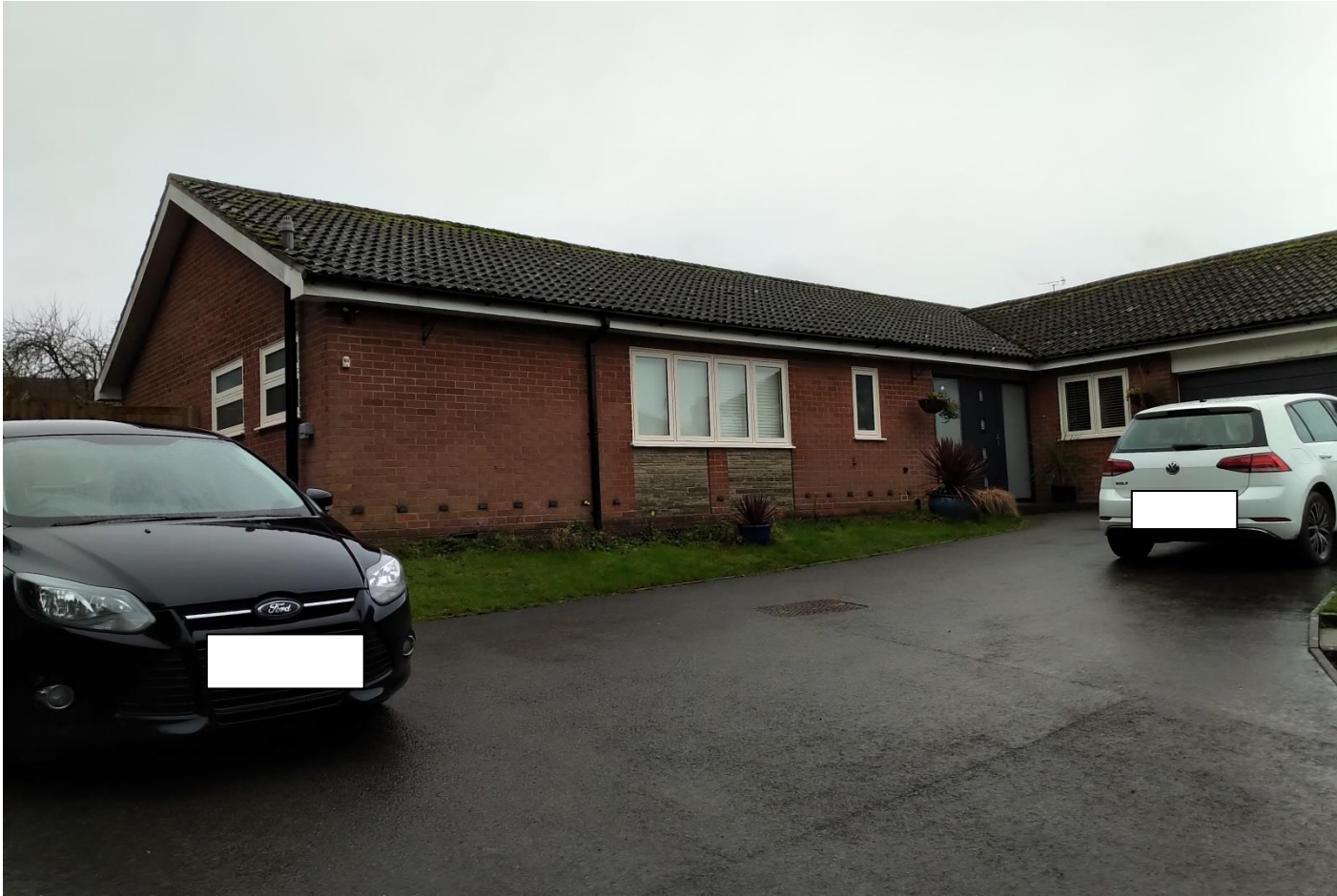
Kestrel Halloughton Nottinghamshire NG25 0QP