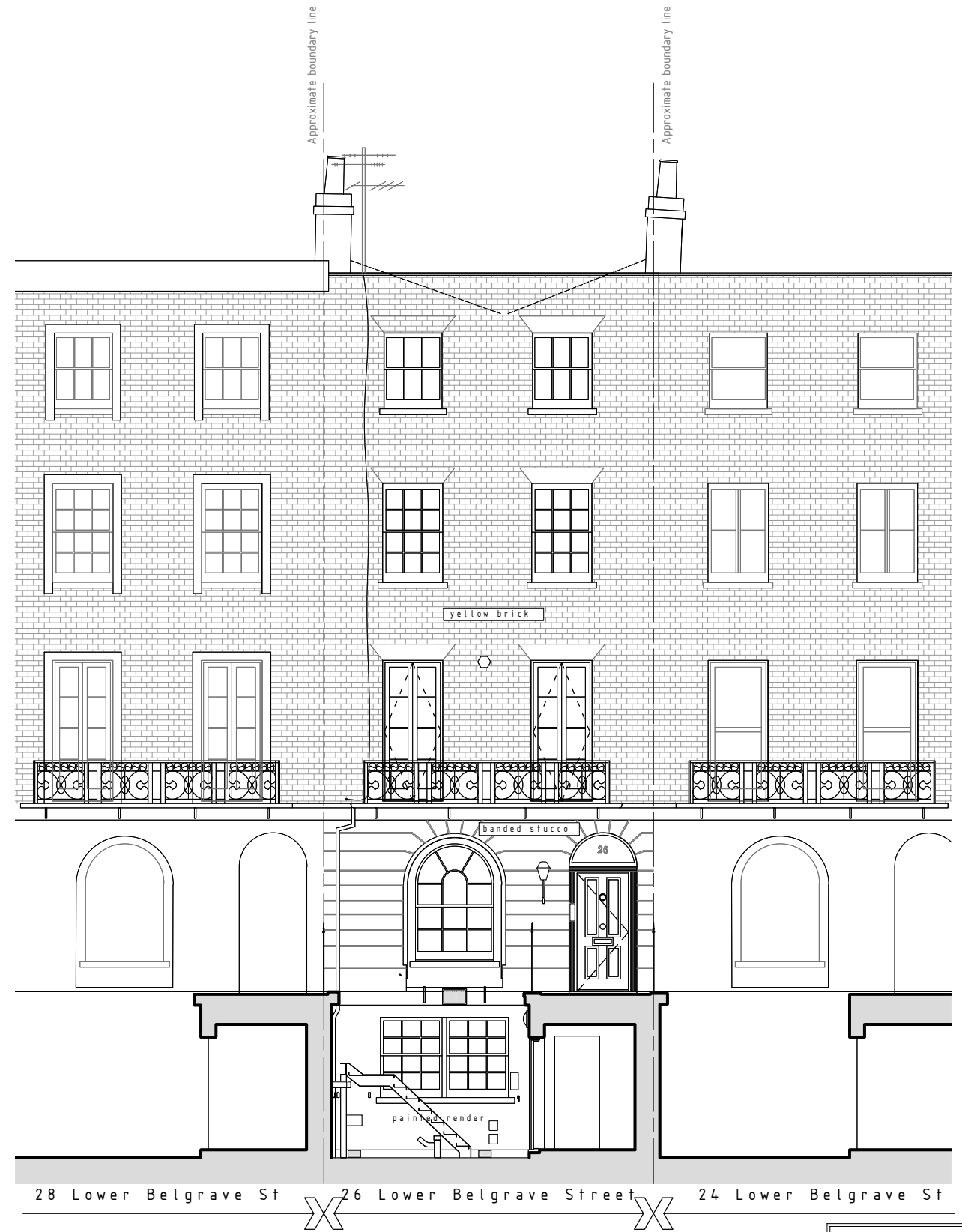
28 Lower Belgrave St X 26 Lower Belgrave Street X 24 Lower Belgrave St South West elevation (front)