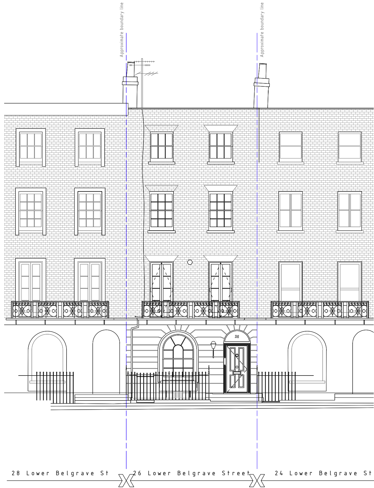
28 Lower Belgrave St X 26 Lower Belgrave Street X 24 Lower Belgrave St South West elevation (street)