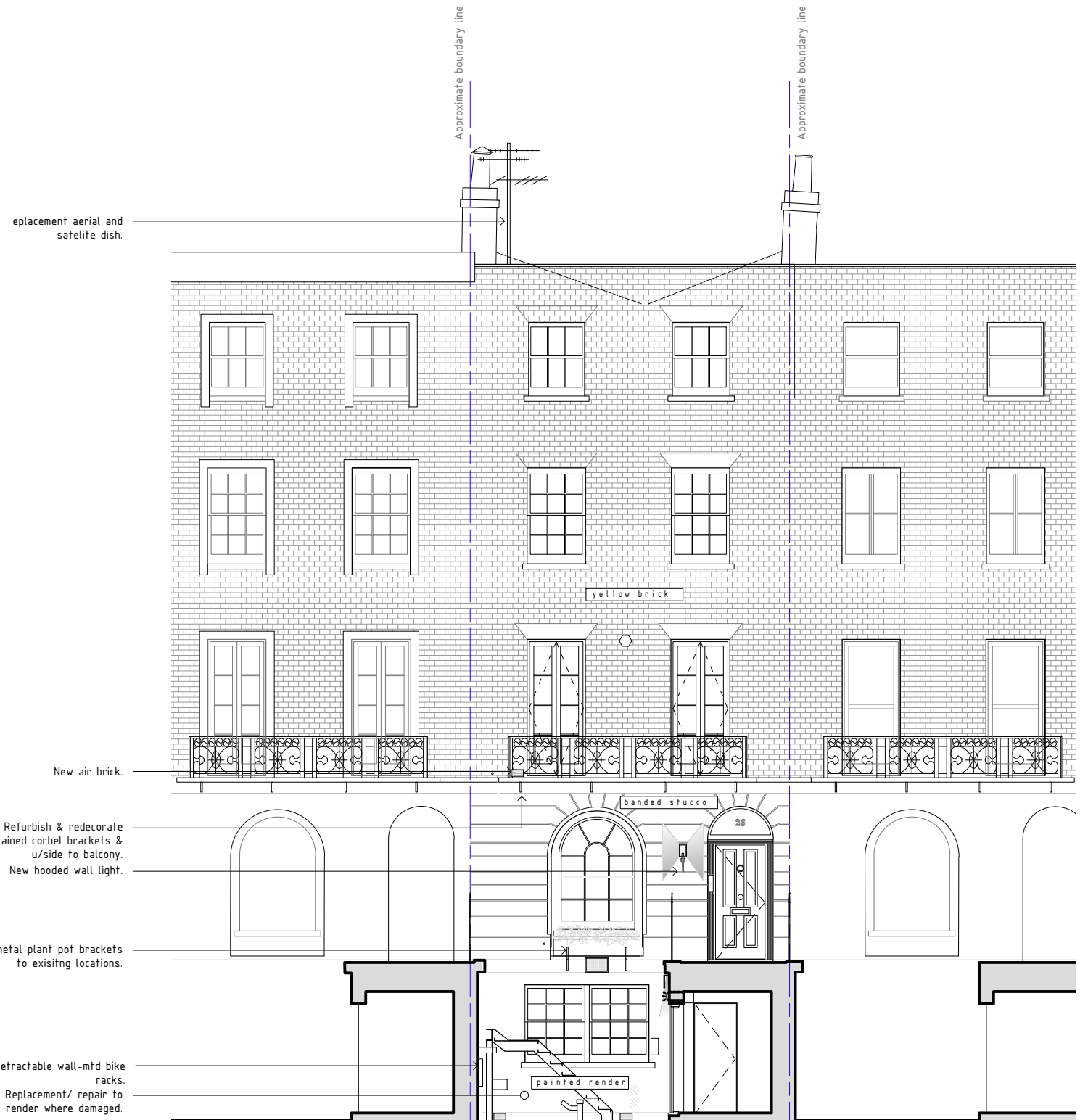
28 Lower Belgrave St X 26 Lower Belgrave Street X 24 Lower Belgrave St South West elevation (front)