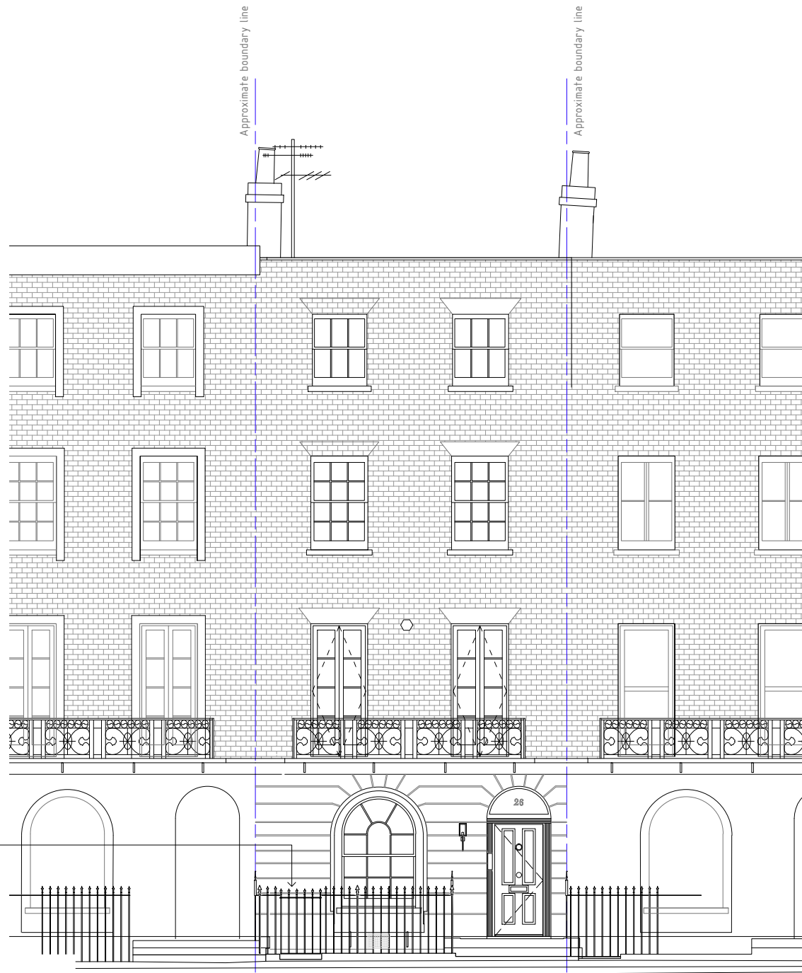
28 Lower Belgrave St X 26 Lower Belgrave Street X 24 Lower Belgrave St South West elevation (street)