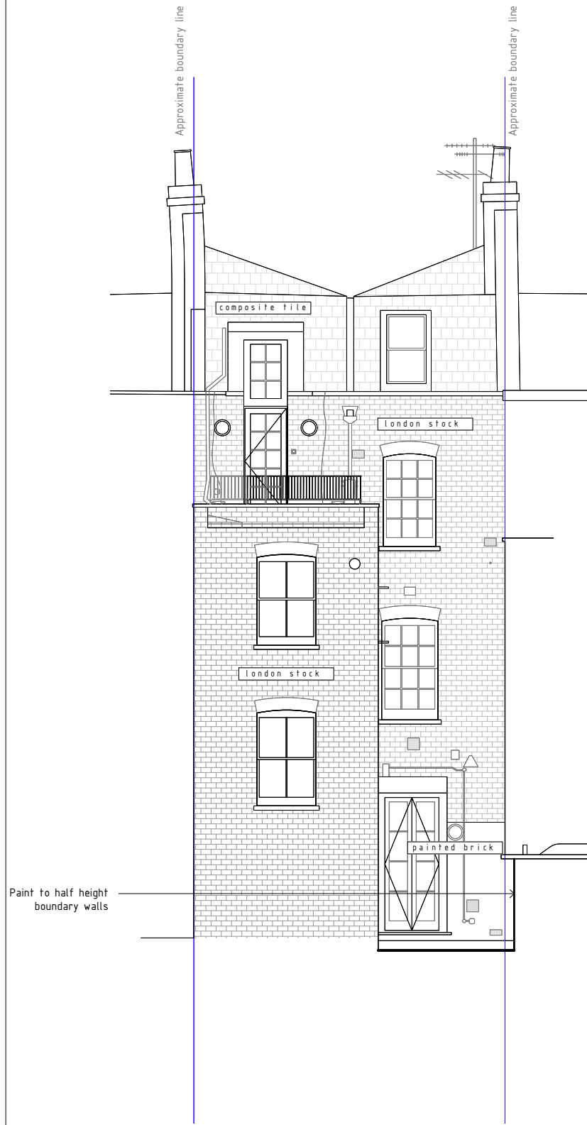
North East elevation (rear)