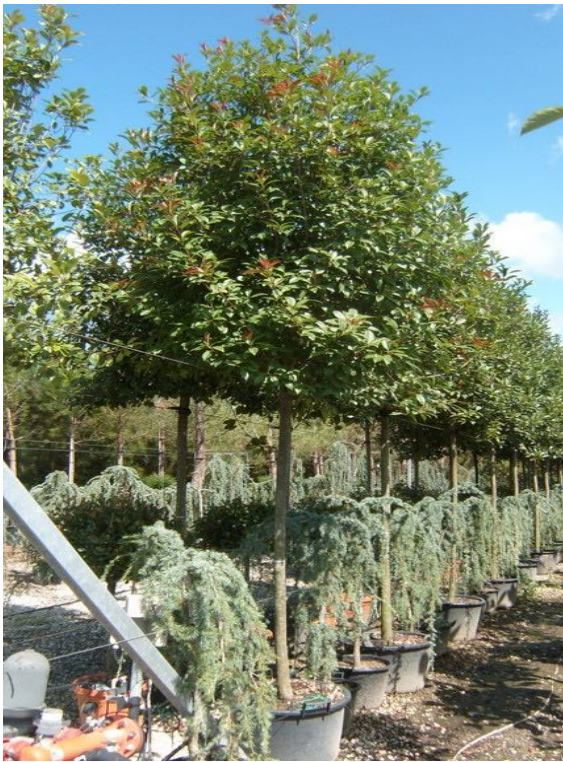
EXAMPLE TREE SPECIES FOR PLANTER: PHOTINIA