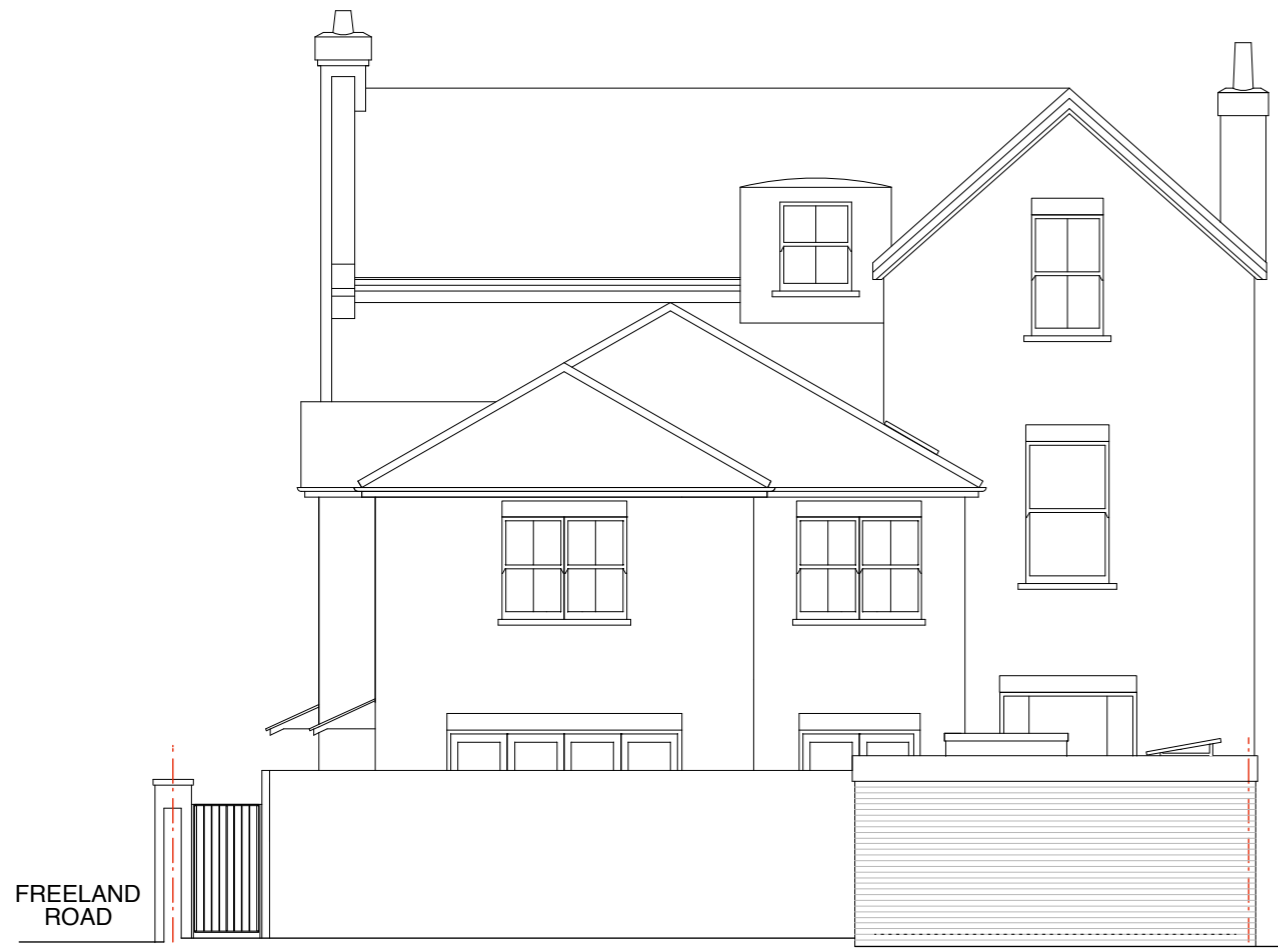
EAST FACING ELEVATION