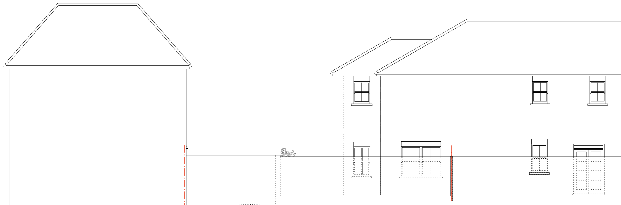
NORTH FACING ELEVATION