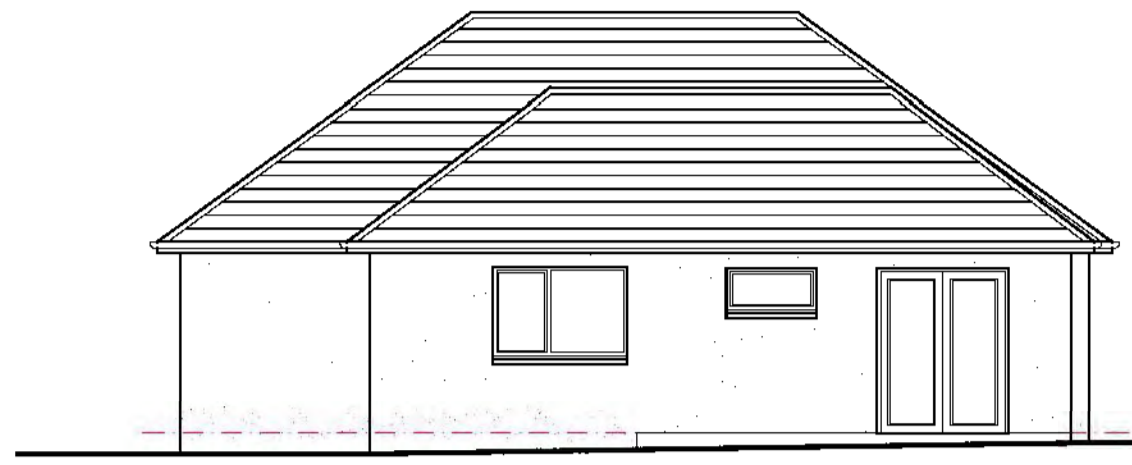
north elevation @ 1:100