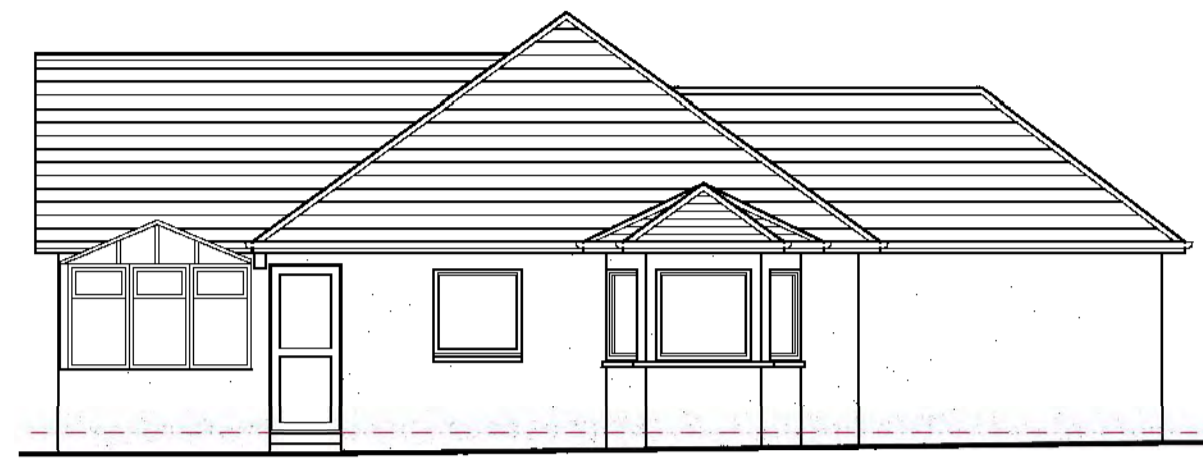
east elevation @ 1:100