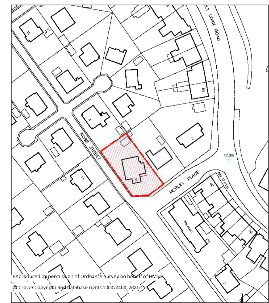
location plan @ 1:1250