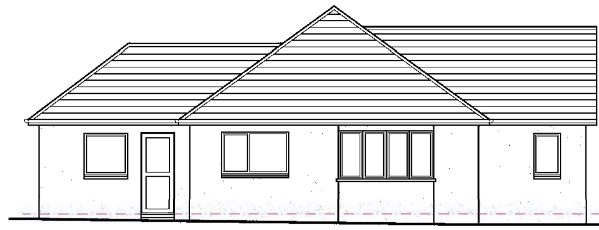
west elevation @ 1:100