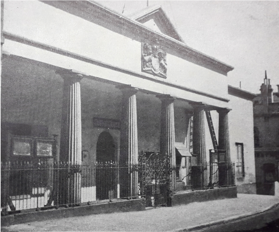
(a) Georgian Town Houses: Customs House, Falmouth, c. 1830