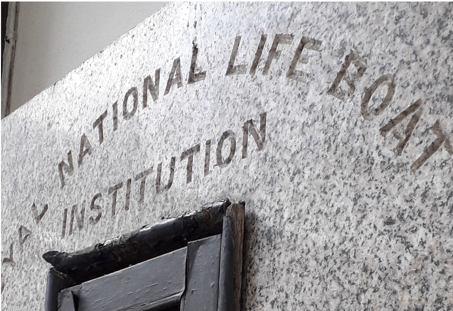
RNLI Inscription on the Housing above the Barometer

original position, so that it can be accessed for viewing without first having to seek permission to be allowed into private space in order to do so. Falmouth Town Council and Fullers have agreed the ownership of the housing will be made over to the Town Council to secure its public ownership, provided the housing is moved from its current location to the proposed location.