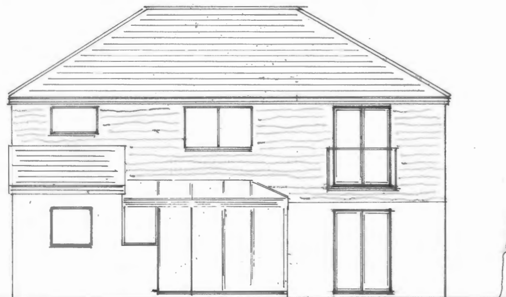
SOUTH WEST ELEV