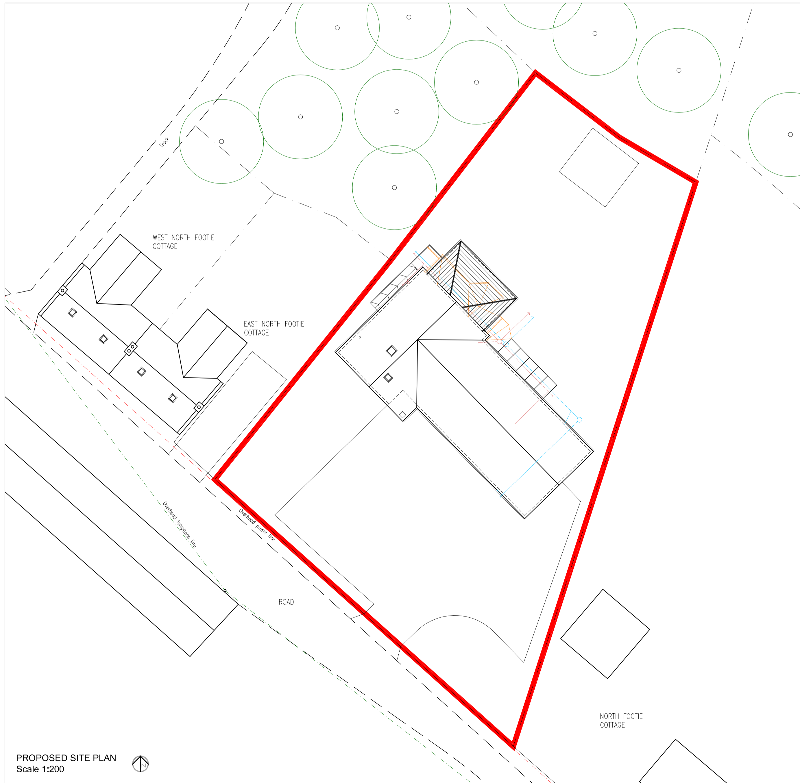
PROPOSED SITE PLAN Scale 1:200