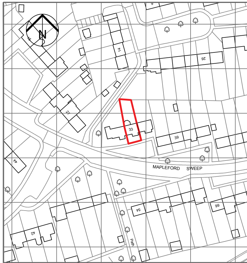
EXISTING LOCATION PLAN