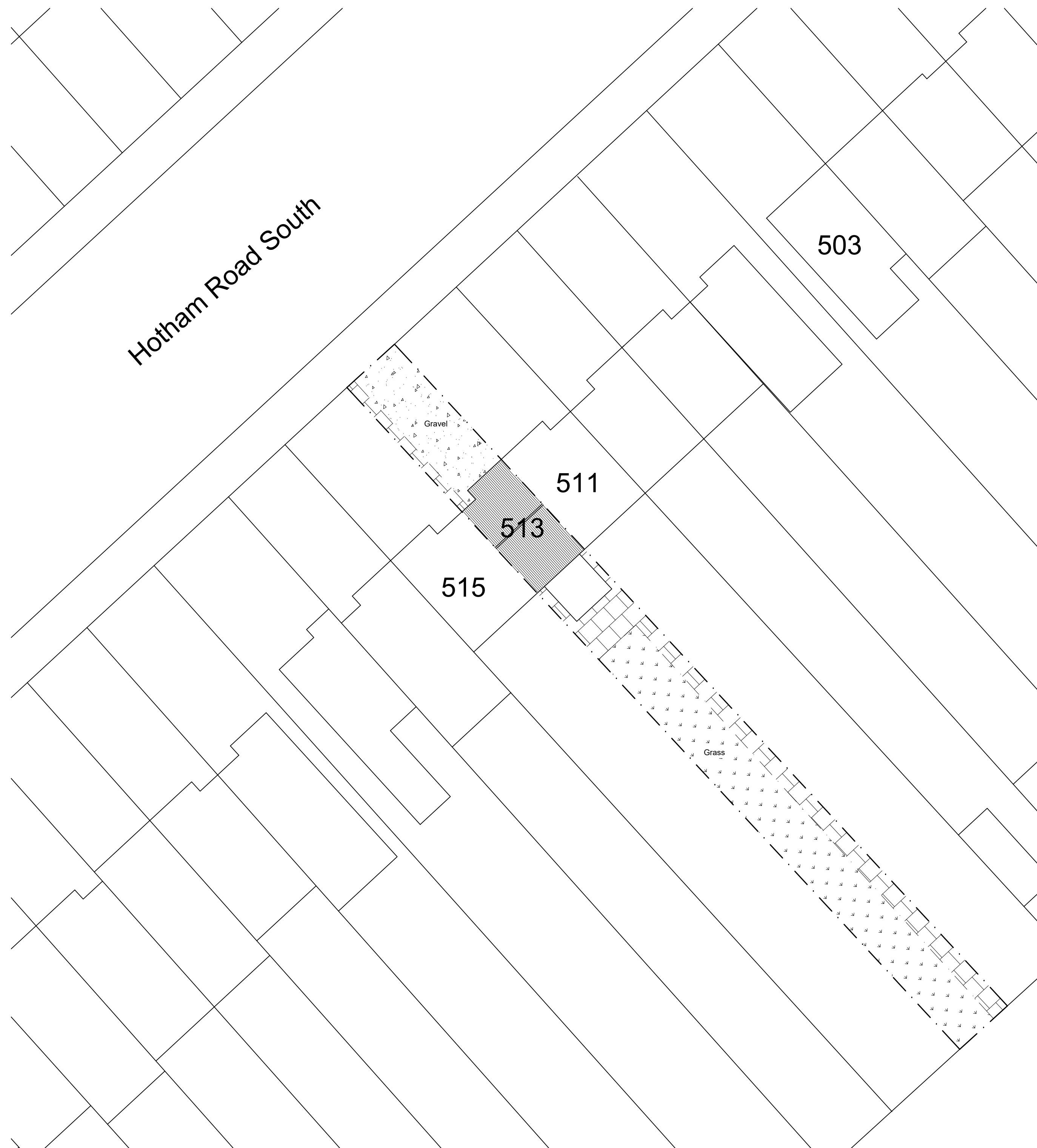
Existing Block Plan @ 1:200