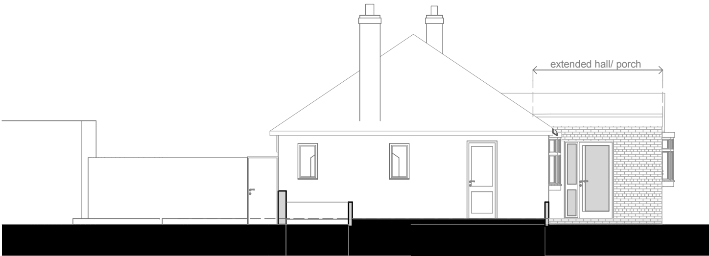
SIDE (TWO) ELEVATION