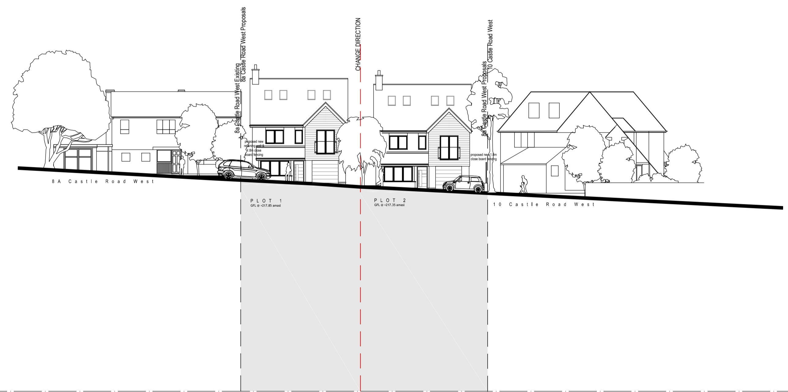
200m above mean average sea level STREETSCAPE ELEVATION

COPYRIGHT Confidential copyright Lapworth Architects under berne & universal copyright convention. Information contained within this drawing is the sole copyright of Lapworth Architects and is not to be reproduced without their express permission. This document must not be copied without written permission and the contents must not be imparted to a third party nor be used for any unauthorised purpose.