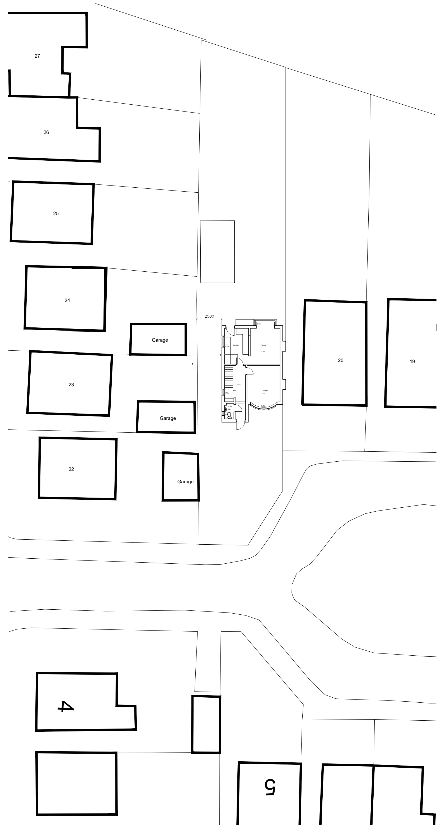
Existing Block Plan Scale 1:200

Do not scale off this drawing - All dimensions and setting out to be verified on site, if in doubt contact the originator for clarification. This drawing is the property of OXEDIO. Copyright is reserved by them and the drawing is issued on the condition that it is not copied, reproduced, related or disclosed to any unauthorised person, either wholly or in part without the consent in writing of OXEDIO.