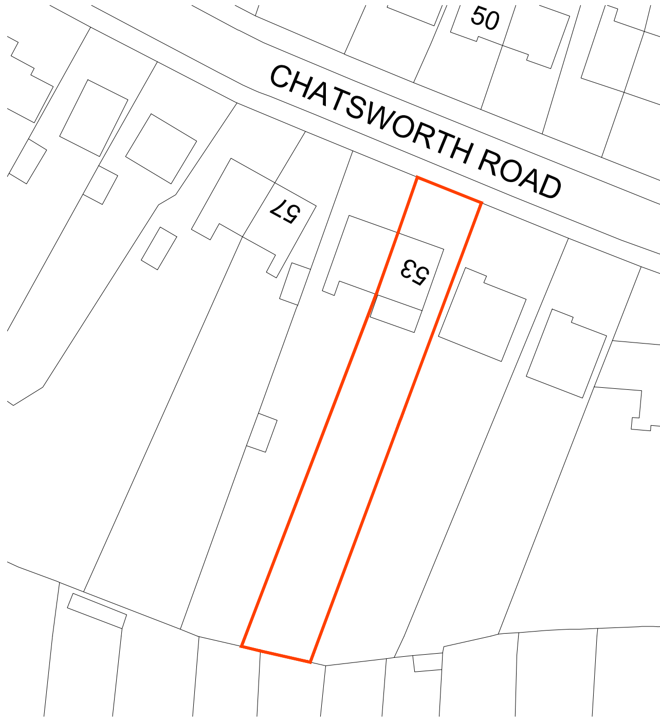
PROPOSED SITE/LOCATION PLAN SCALE 1:500@A3