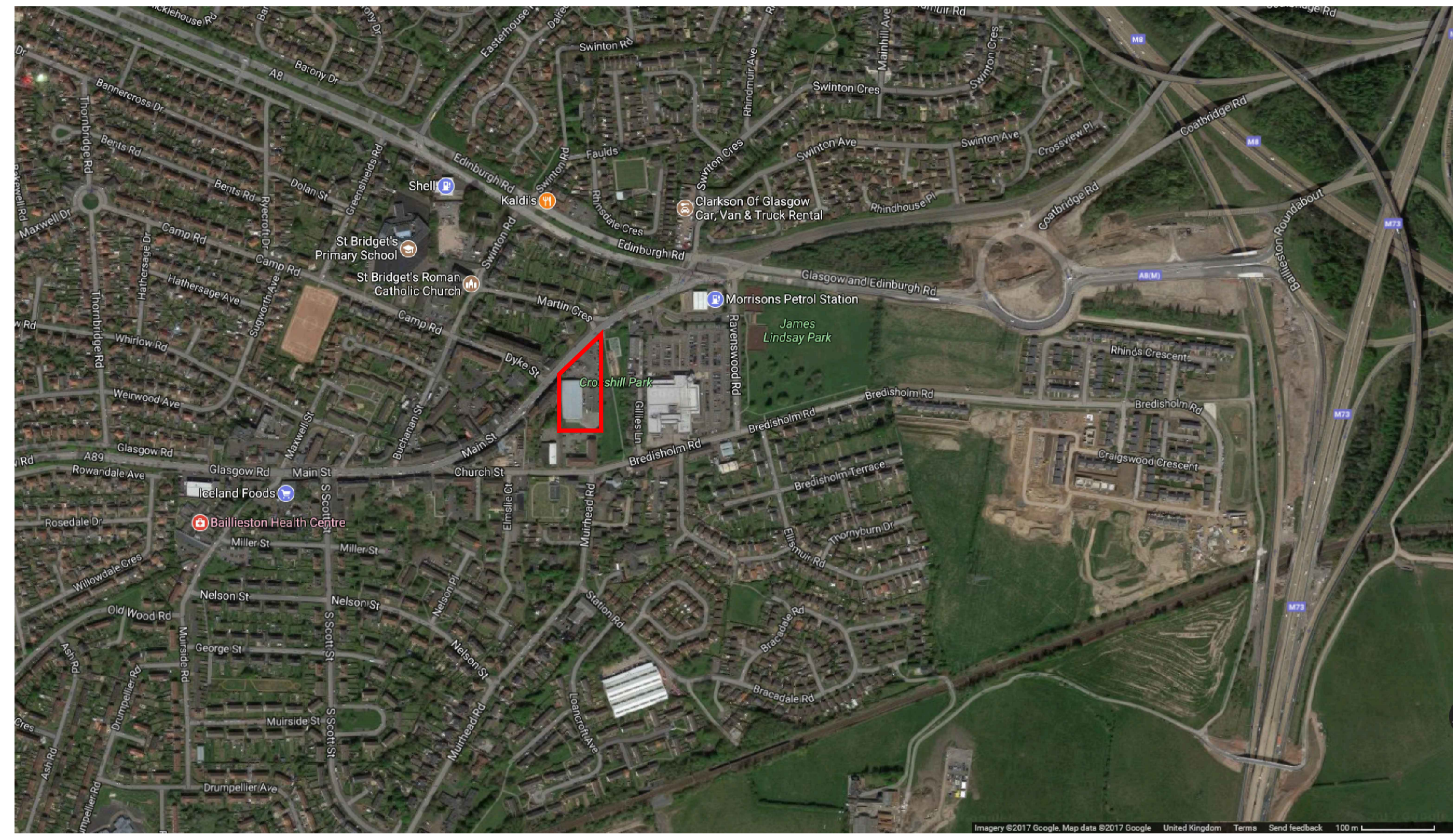
REFERENCE IMAGE