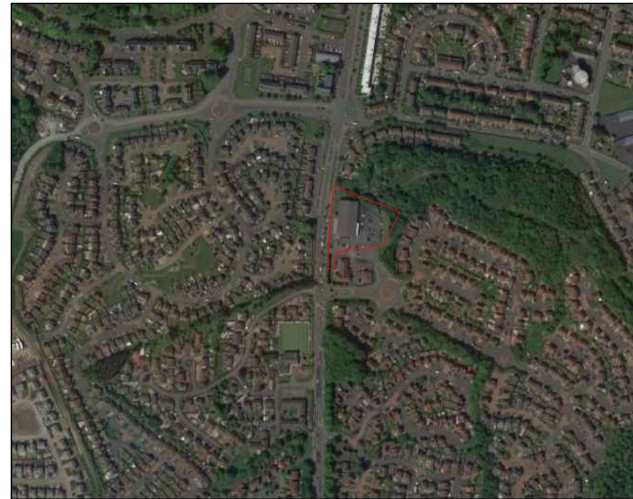
REFERENCE IMAGE

smith design associates www.smithdesign.co.uk