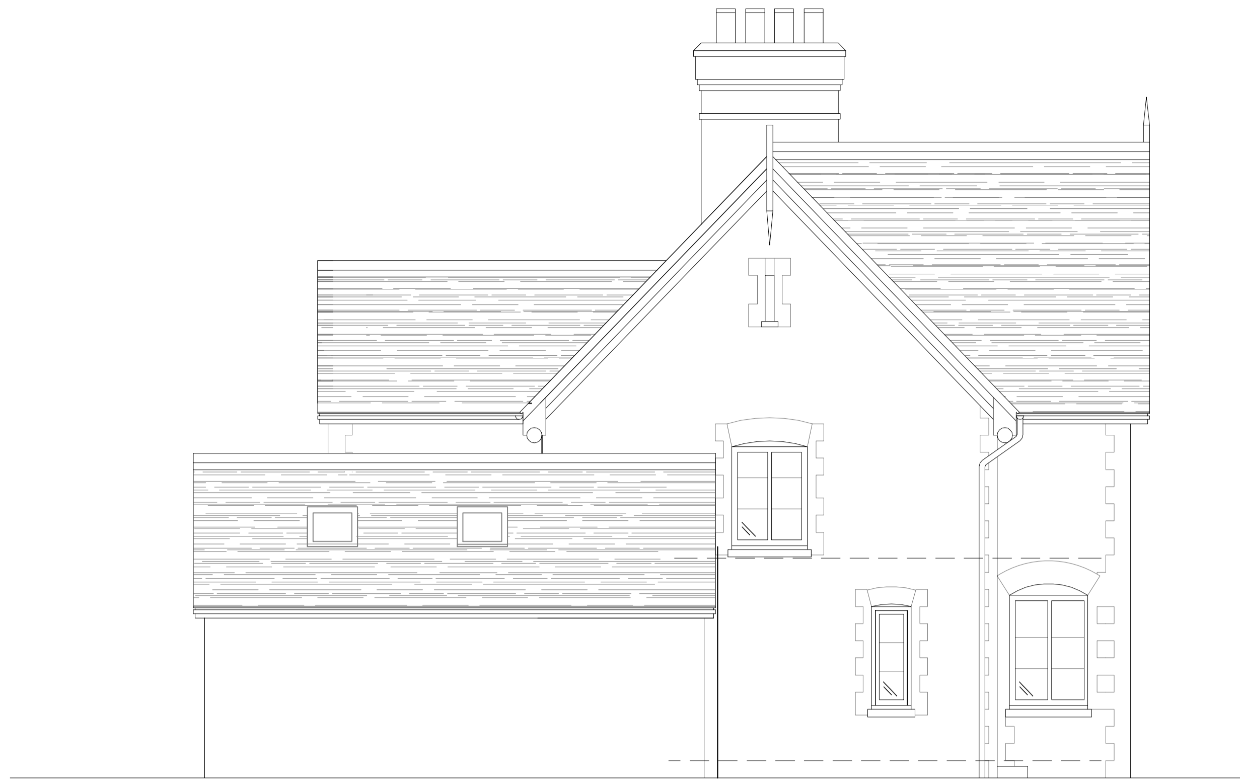
PROPOSED SIDE ELEVATION Scale 1:50