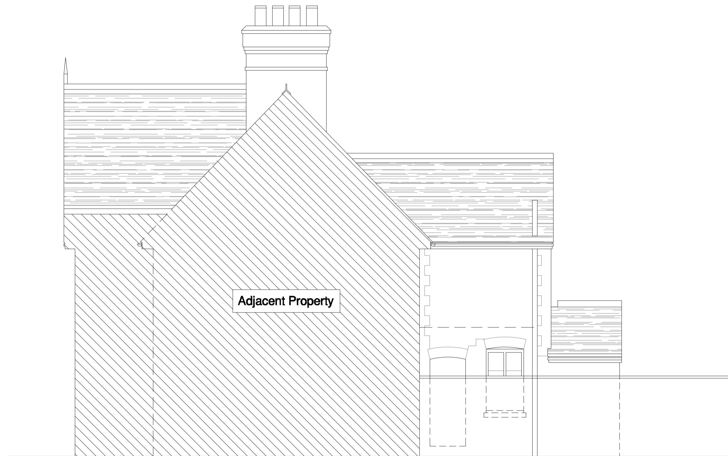
PROPOSED SIDE ELEVATION Scale 1:50